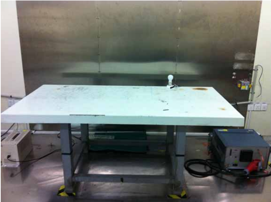
Front View of Conducted Disturbance Measurement