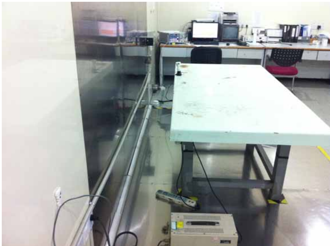
Side View of Conducted Disturbance Measurement