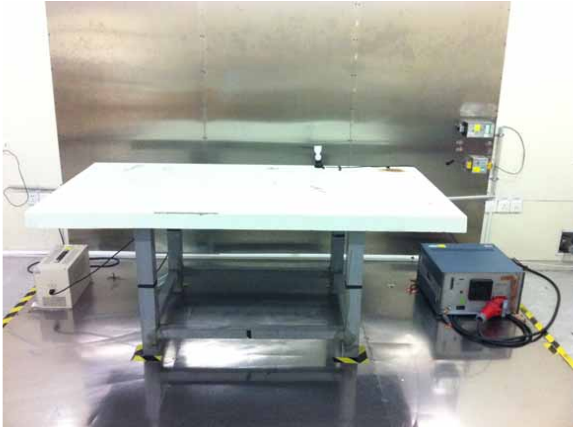
Front View of Conducted Disturbance Measurement