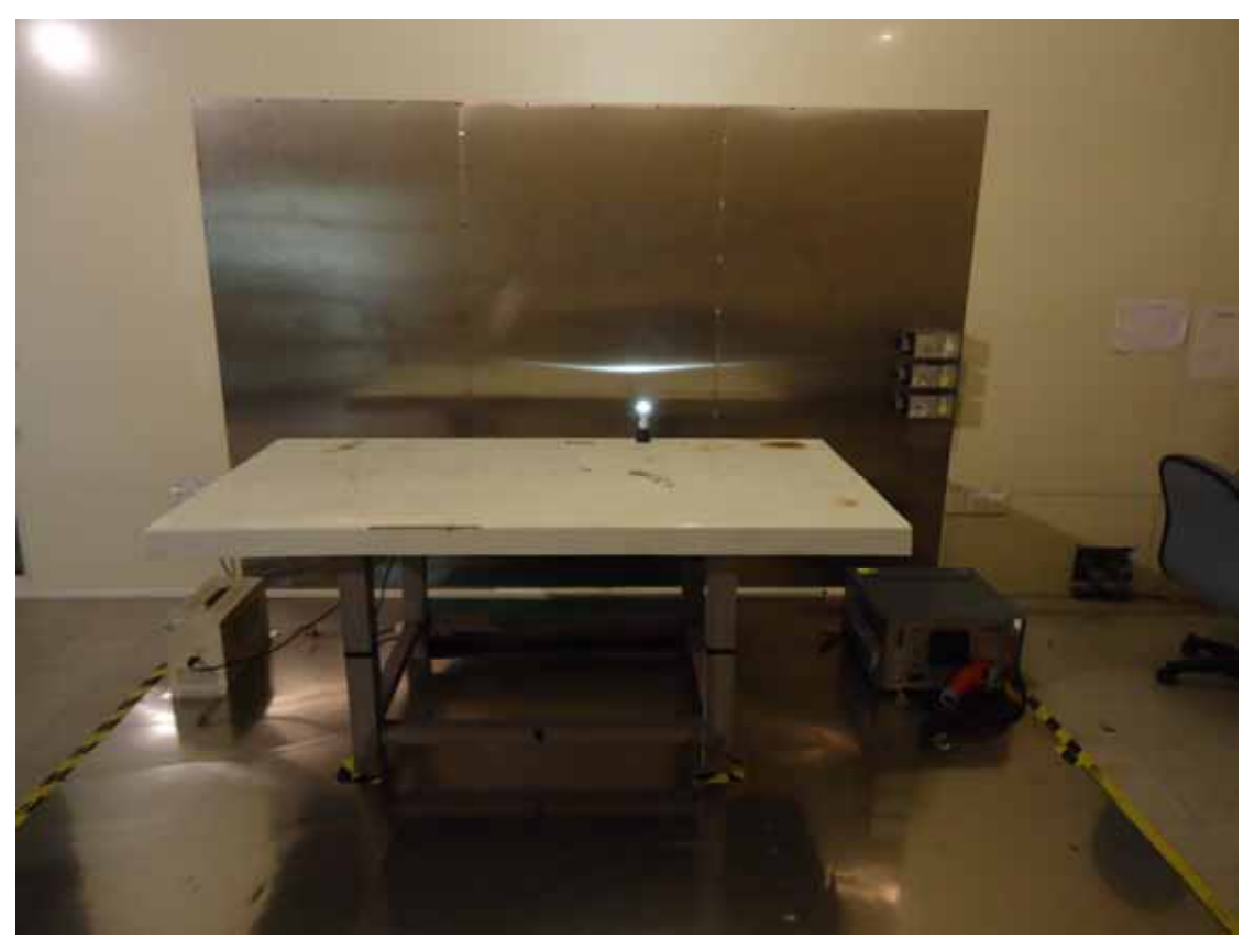
Front View of Conducted Disturbance Measurement