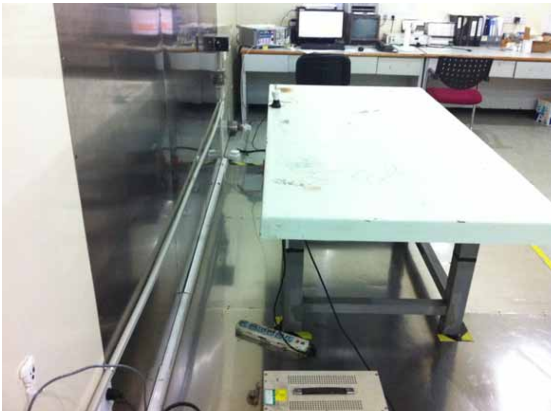
Side View of Conducted Disturbance Measurement