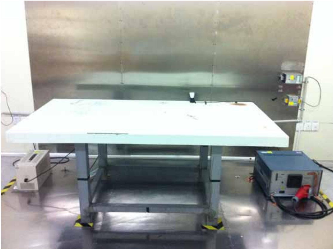
Front View of Conducted Disturbance Measurement