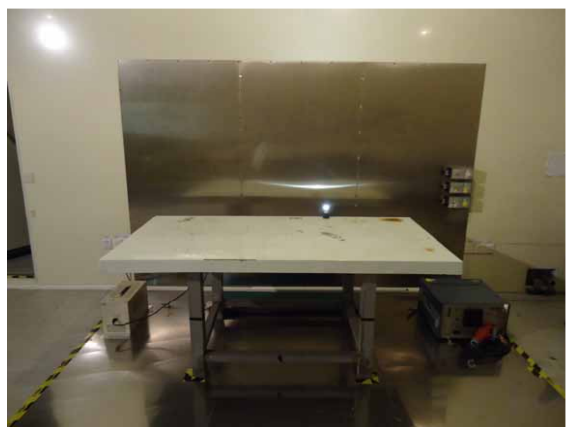
Front View of Conducted Disturbance Measurement