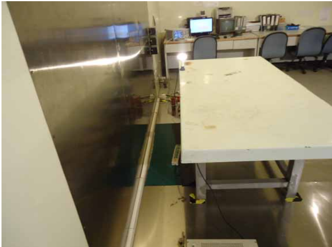
Side View of Conducted Disturbance Measurement