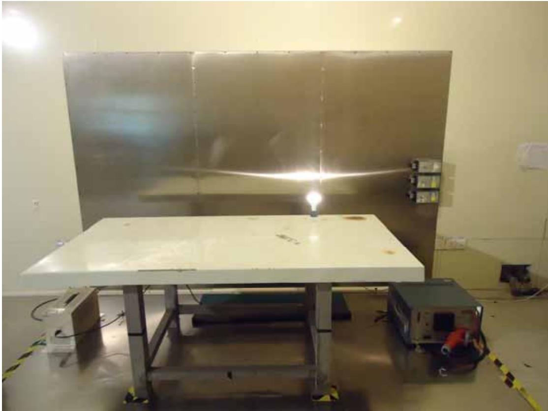
Front View of Conducted Disturbance Measurement