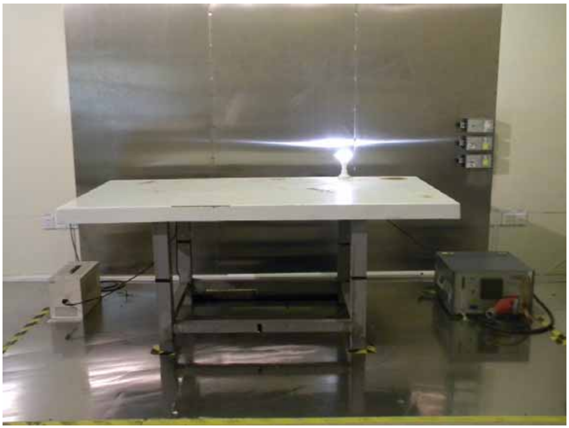
Front View of Conducted Disturbance Measurement