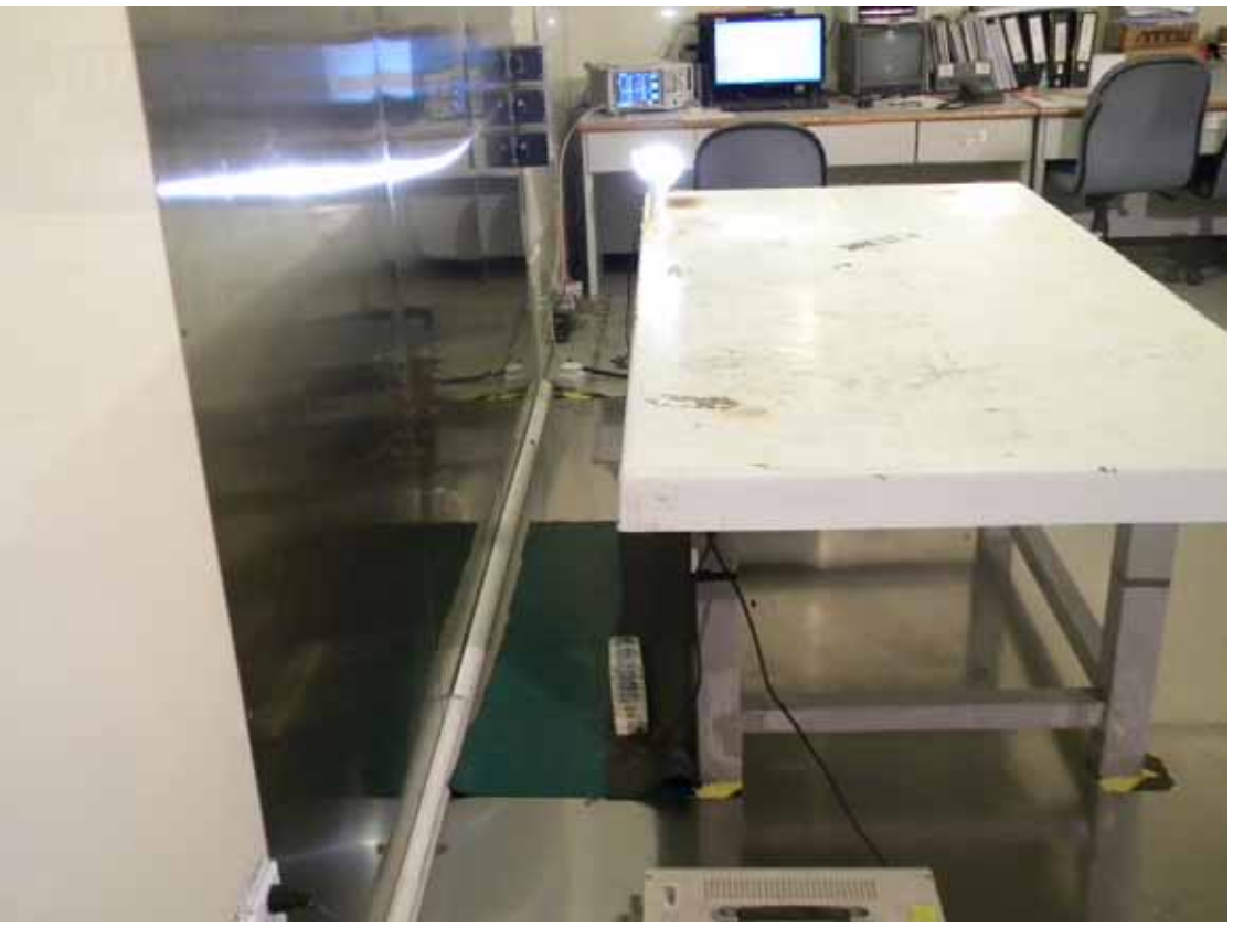
Side View of Conducted Disturbance Measurement