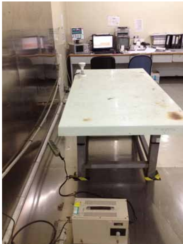
Side View of Conducted Disturbance Measurement