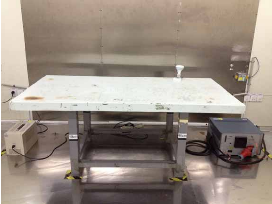
Front View of Conducted Disturbance Measurement