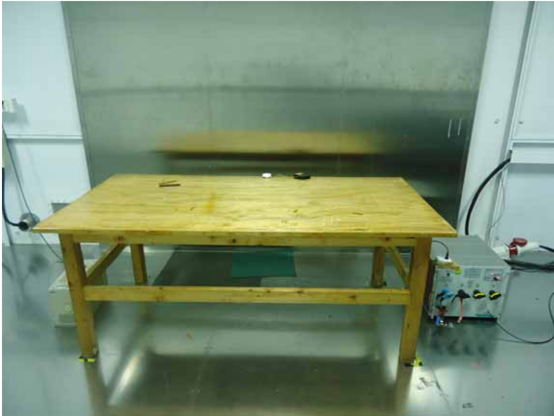
Front View of Conducted Disturbance Measurement