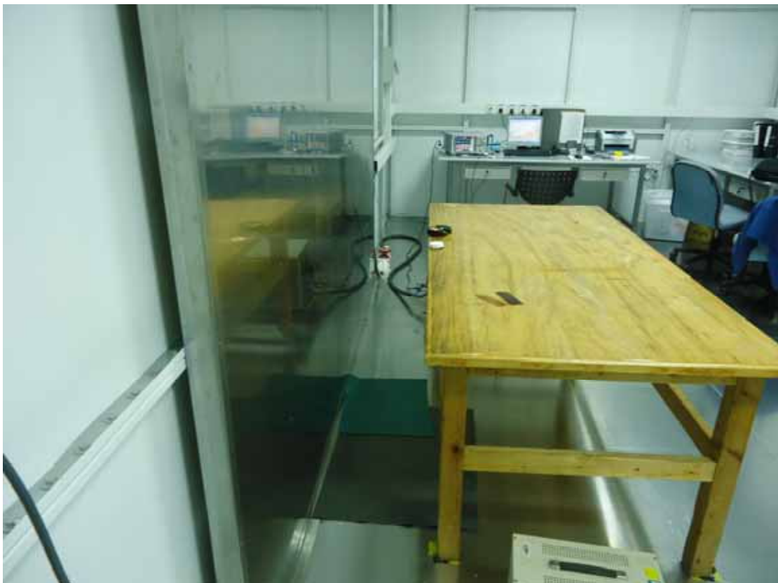
Side View of Conducted Disturbance Measurement