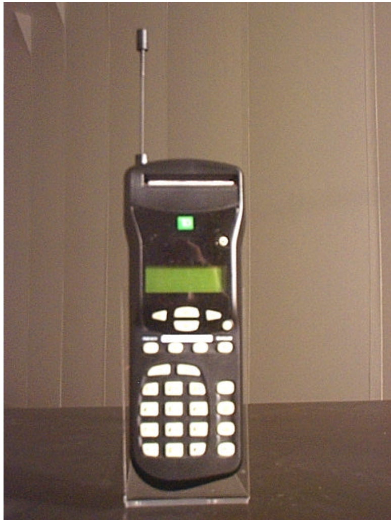
MIST Freedom II-M with a Research in Motion R902M-2-0 transmitter