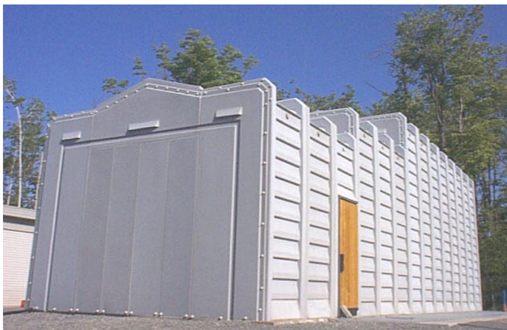
Fig. 1.b APREL's OATS (Open Area Test Site)