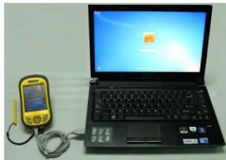
Figure 3: Connection