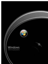
Figure 1: Splash Screen