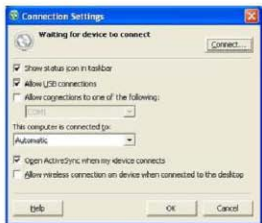
Figure 2: Connection setting

Turn on the device and enter Windows system. Use data cable to connect device with PC (figure 3)