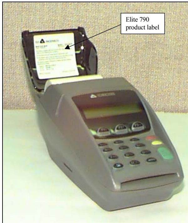
Diagram 2: Position of Product label on Elite 790 GPRS unit.