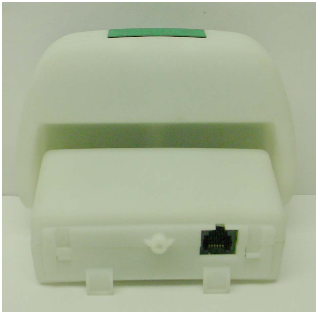
Ingenico Contactless Payment Expansion Module FCC ID: O34-CPEM-E1K6567 IC: 2586B-CP1K6567