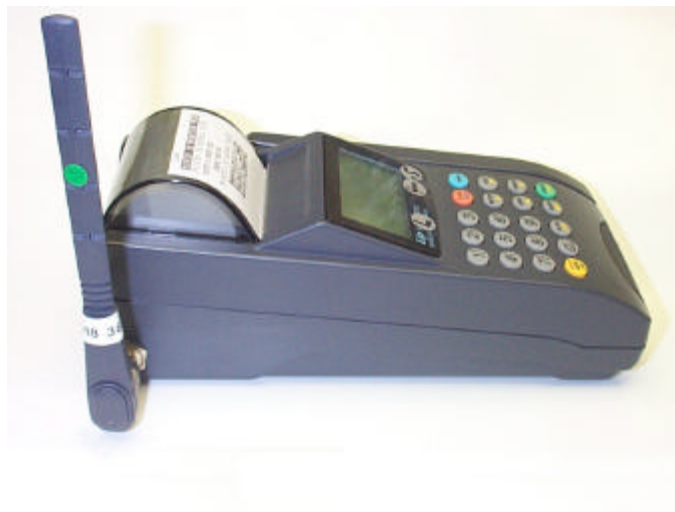
Lipman USA Point of Sale Device Nurit 3010 (TNC)