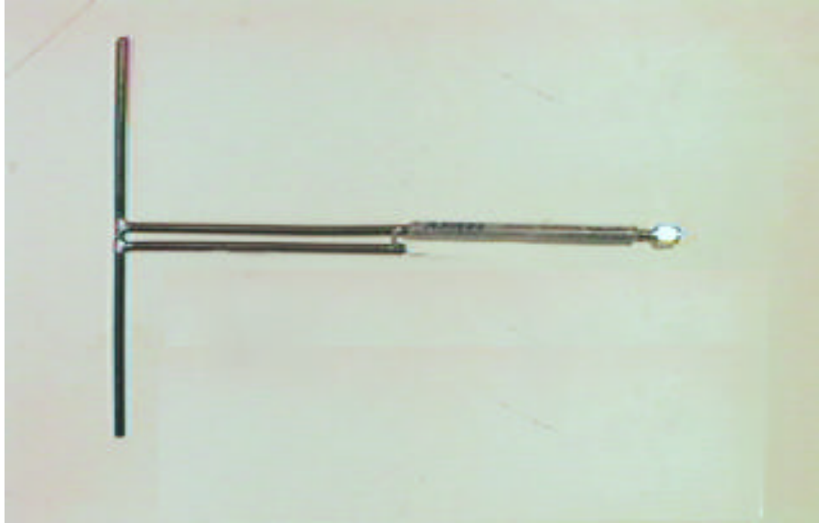
Reference Dipole Antenna Used for ERP Measurement