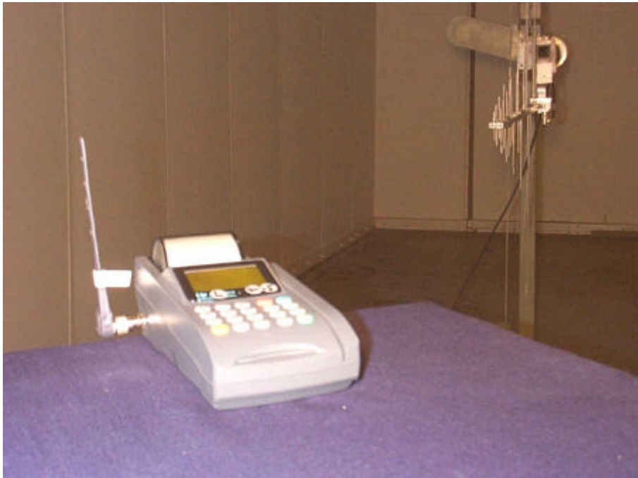
ERP Measurements in OATS