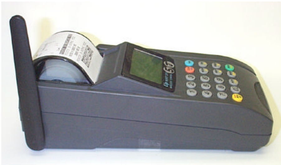
Lipman USA Point of Sale Device Nurit 3010 ARDIS