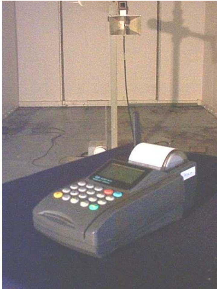
Spurious Measurements in OATS