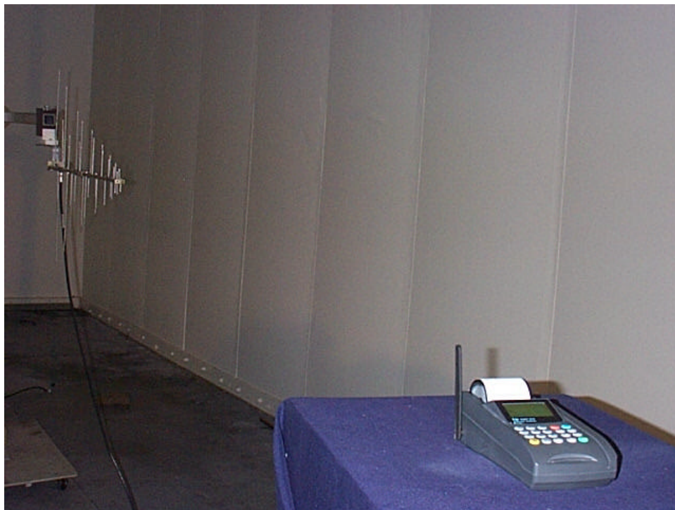
Spurious Measurements in OATS (frequency range: 200 MHz – 1 GHz)