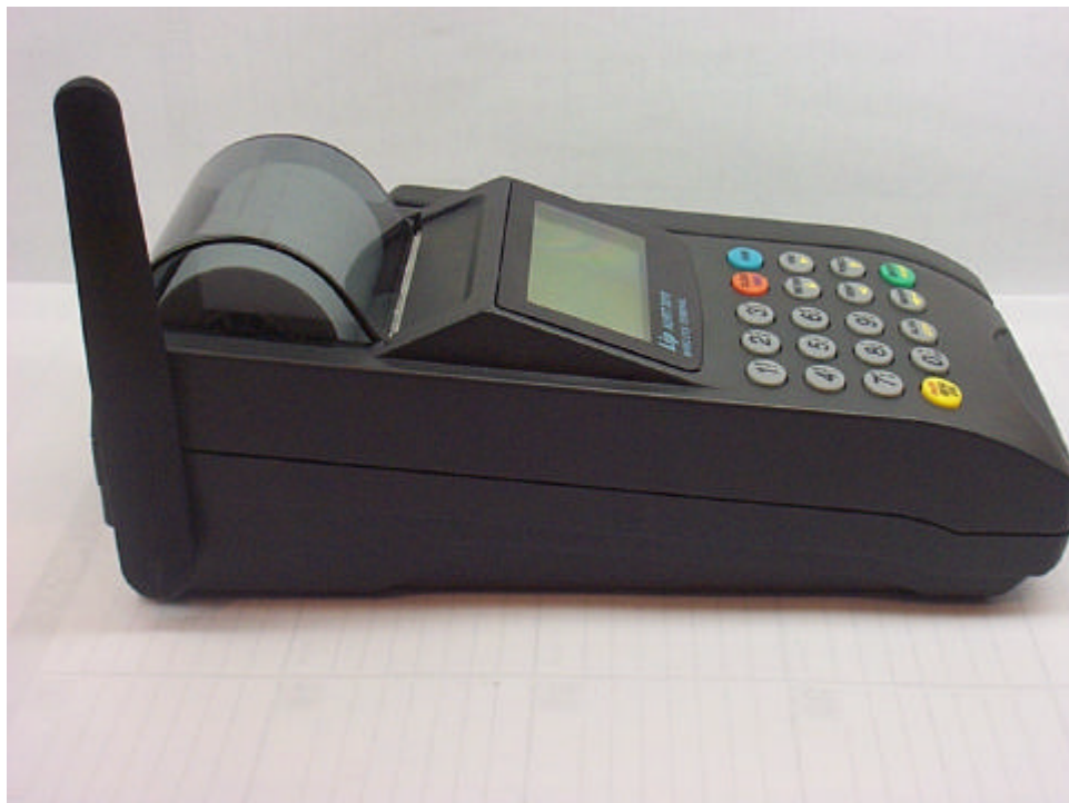
Lipman USA Point of Sale Device Nurit 3010 ARDIS