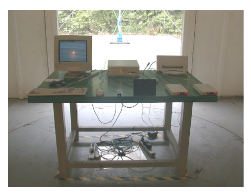
Back View of Radiated Emission Test (Mode 1)