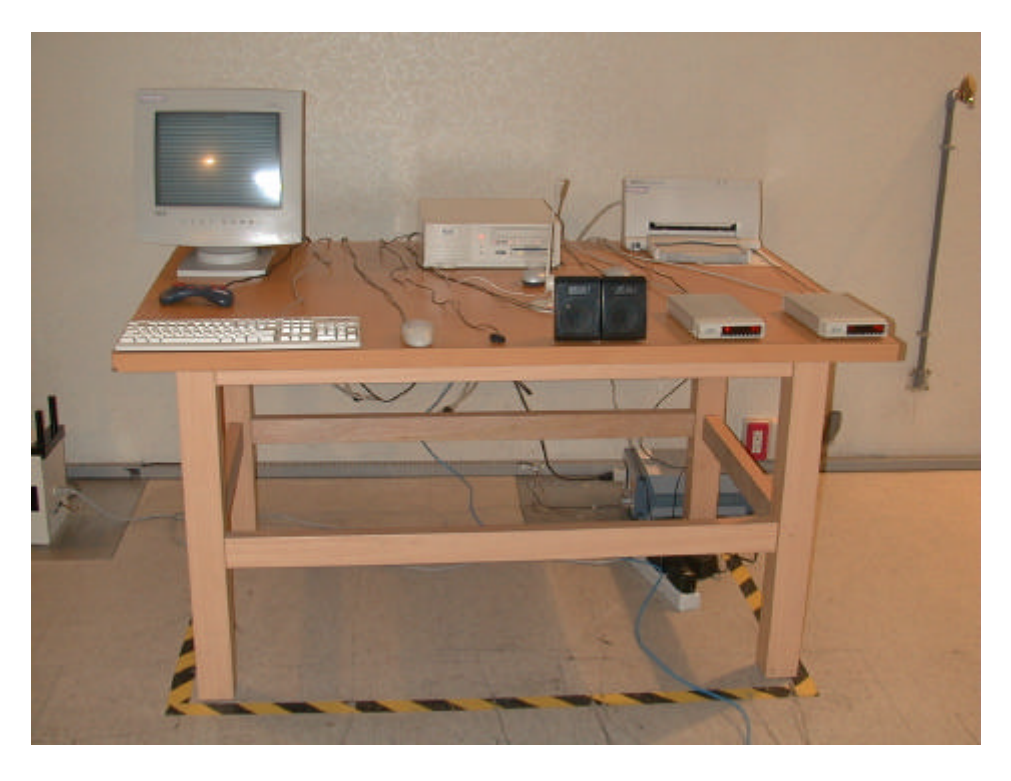
Back View of Conducted Emission (Mode 1)

Front View of Conducted Emission (Mode 1)