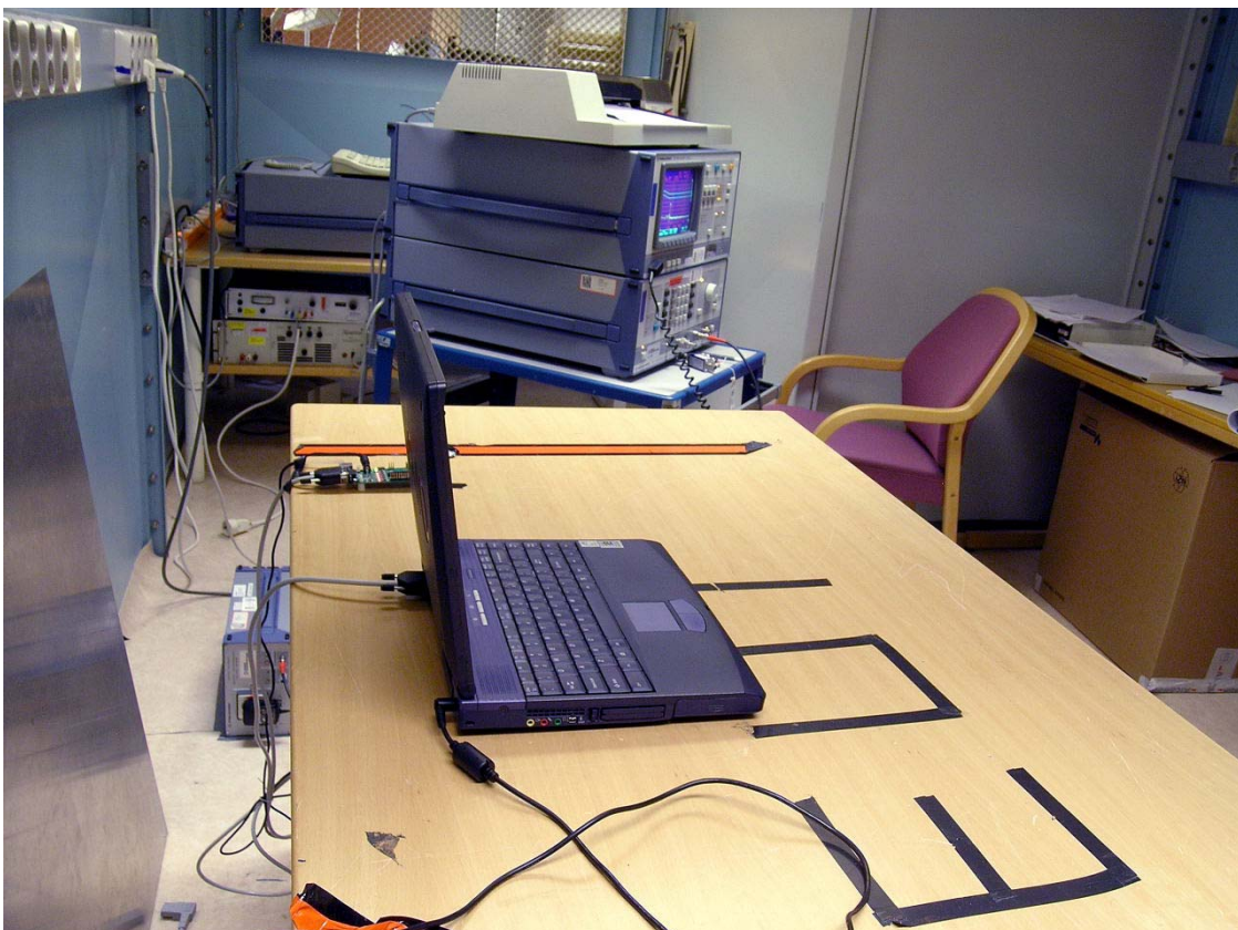
Test setup, Conducted emissions