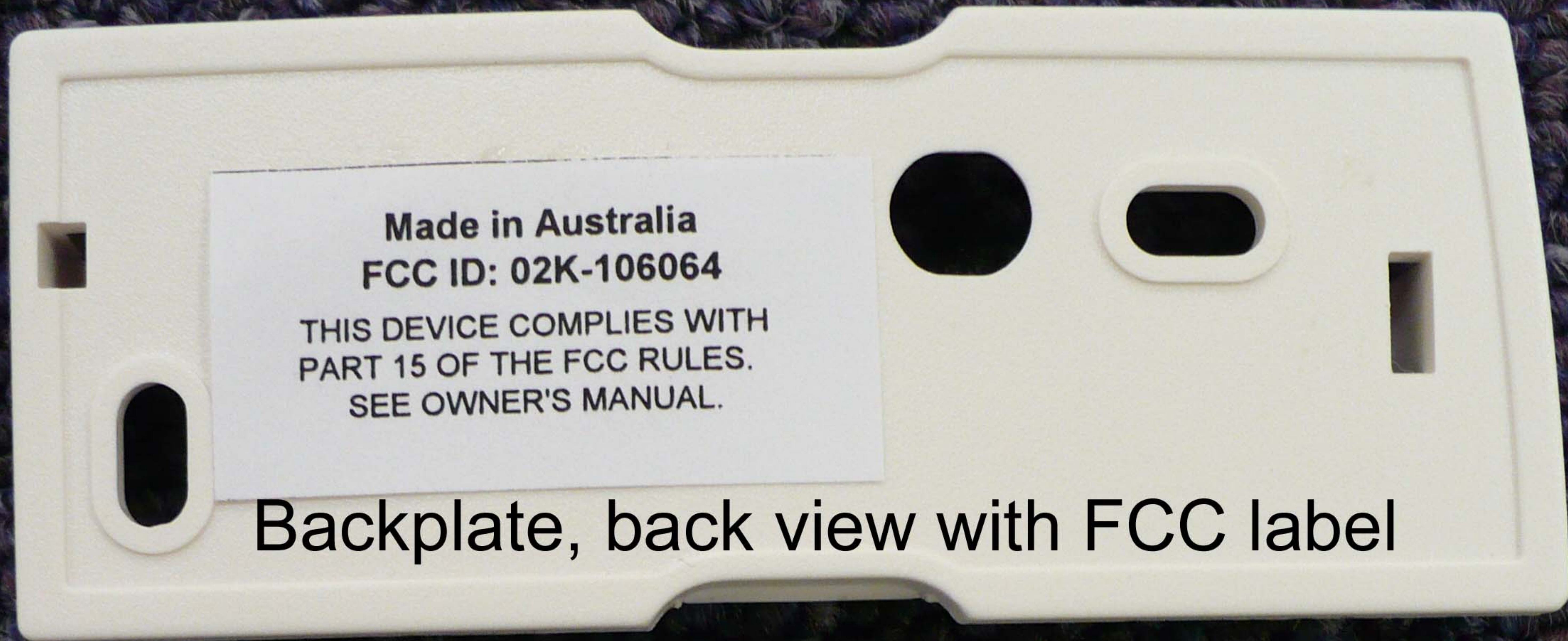
Backplate, back view with FCC label