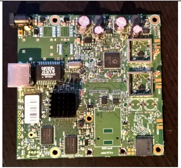
Top of PCB with cans removed