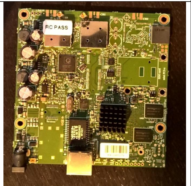
Top of PCB with cans