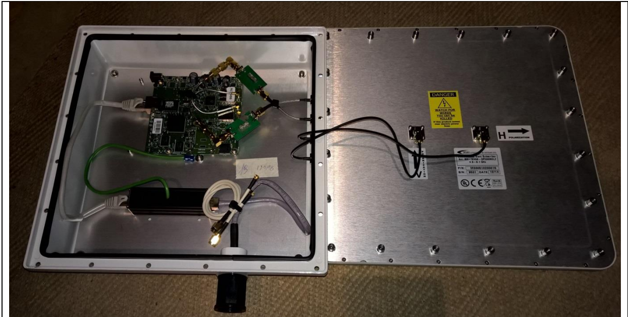
Internal photo showing PCB cable connection to "IB" ports and internal 23dBi antenna connected to ANT ports