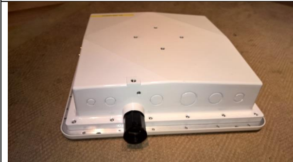
Power-over-Ethernet port (Cat5 cable)