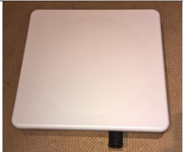
Top of iB440 – the "lid" is a 19dBi flat panel antenna