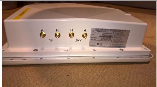
Antenna connectors: "IB" are connected to be PCB "ANT" are connected to the internal 19dBi antenna