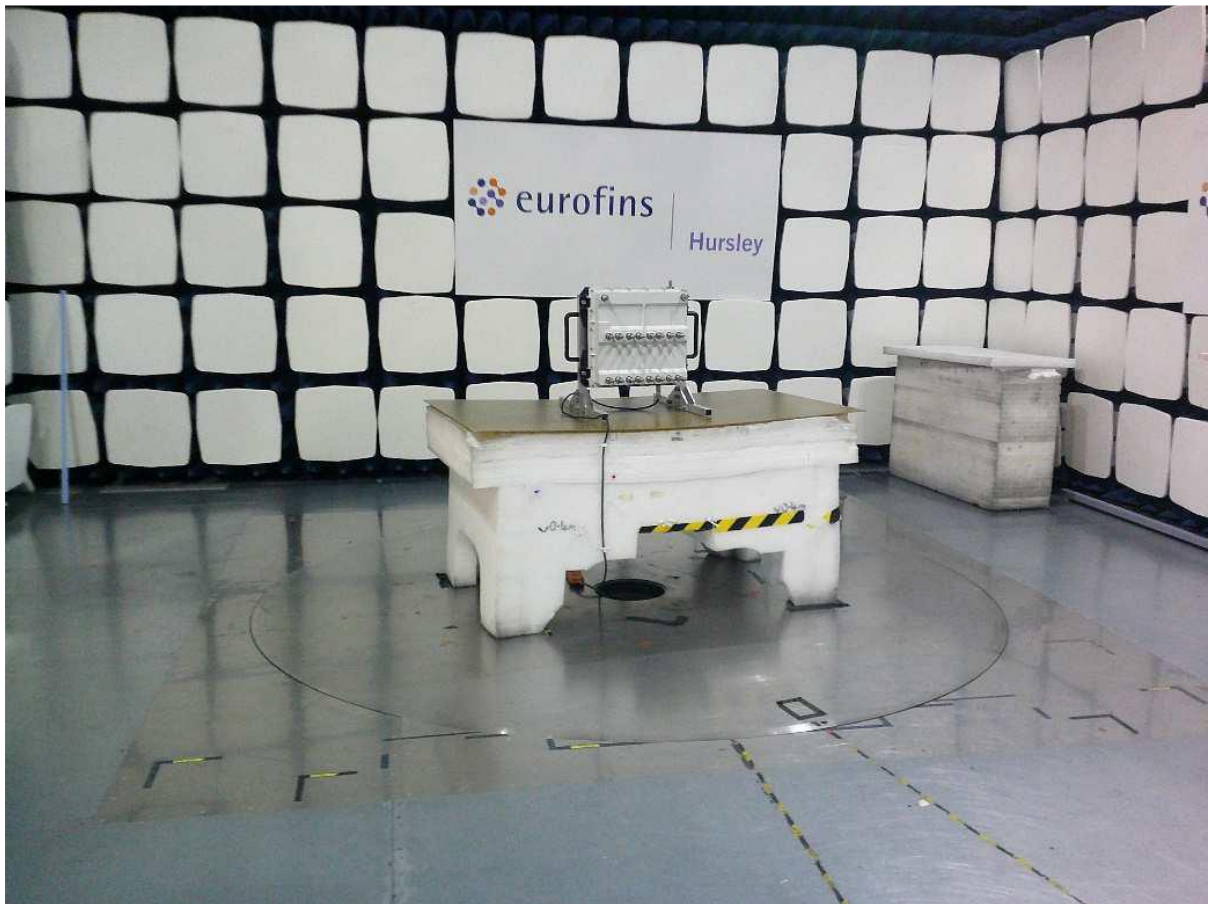
Radiated emissions < 1 GHz