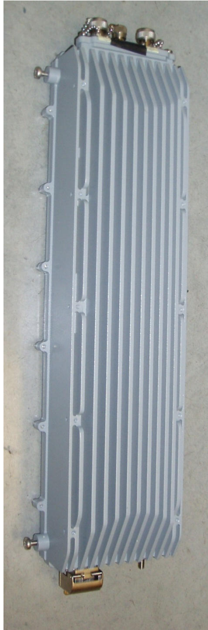
Front Face (Rear is flat panel)