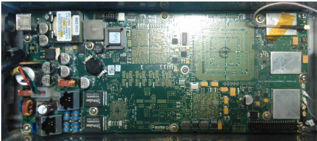
Baseband board (top) with cables removed