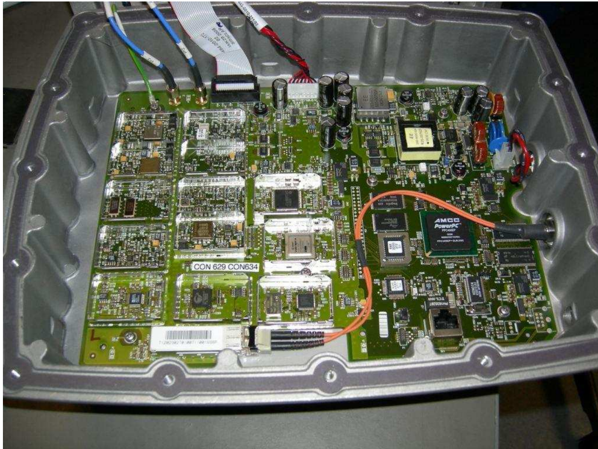
SCRT 1202 board without shielding cans