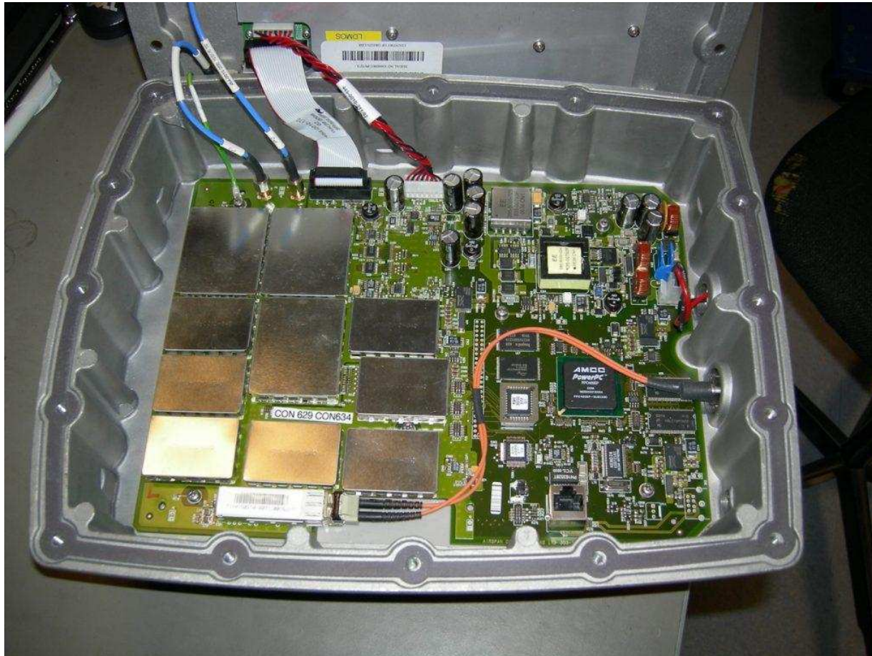
SCRT 1202 board with shielding cans