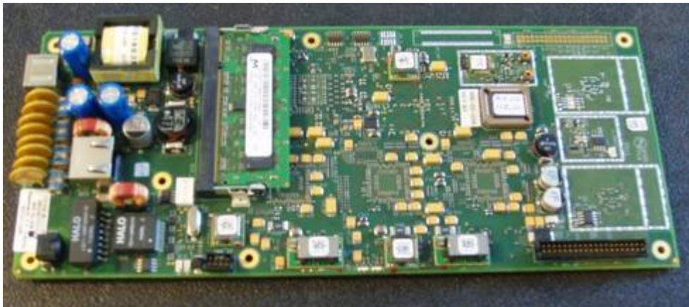
Baseband board (top)