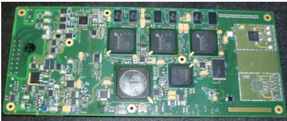
Baseband board (underside)