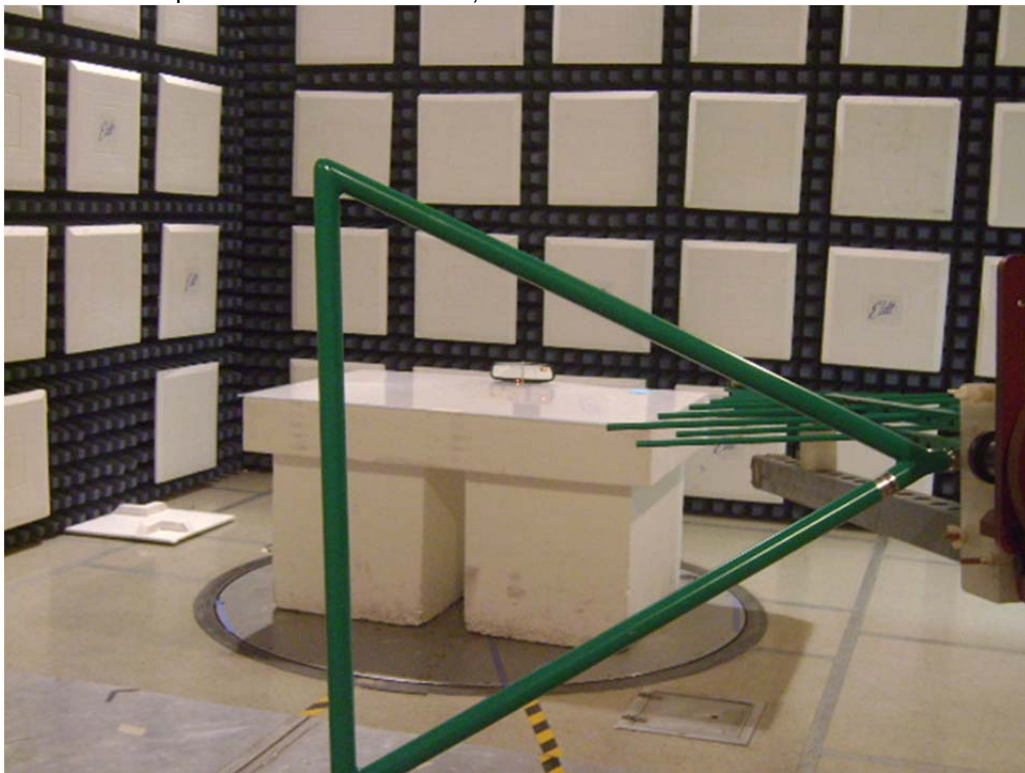
Test Setup for Radiated Emissions, 30MHz to 1GHz – Vertical Polarization