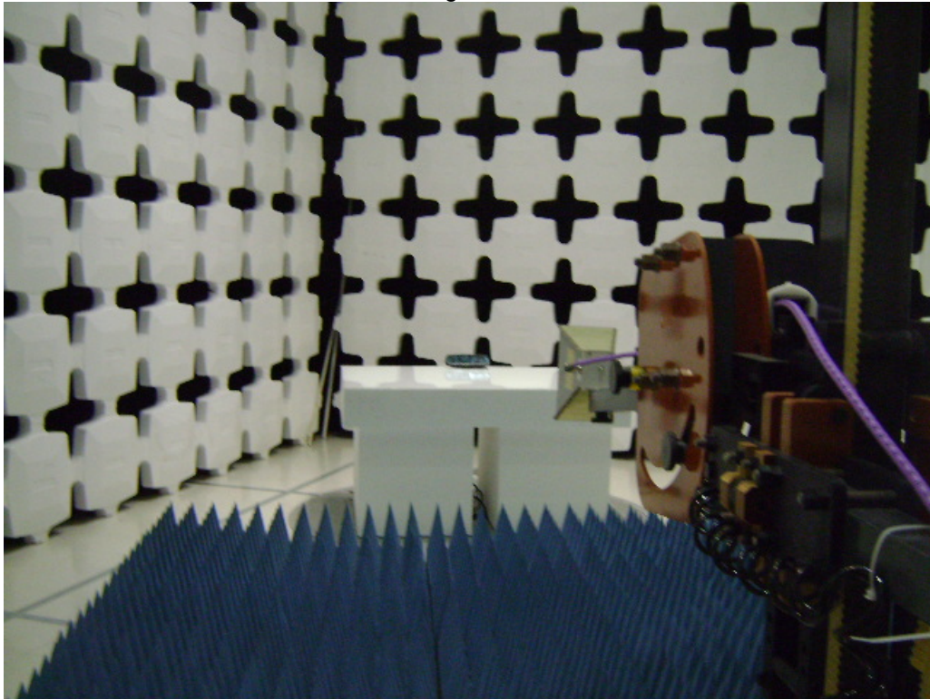
Test Setup for Radiated Emissions Above 1GHz – Horizontal Polarization