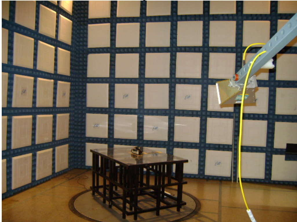
Test Set-up for Radiated Emissions, 1GHz to 5GHz – Vertical Polarization