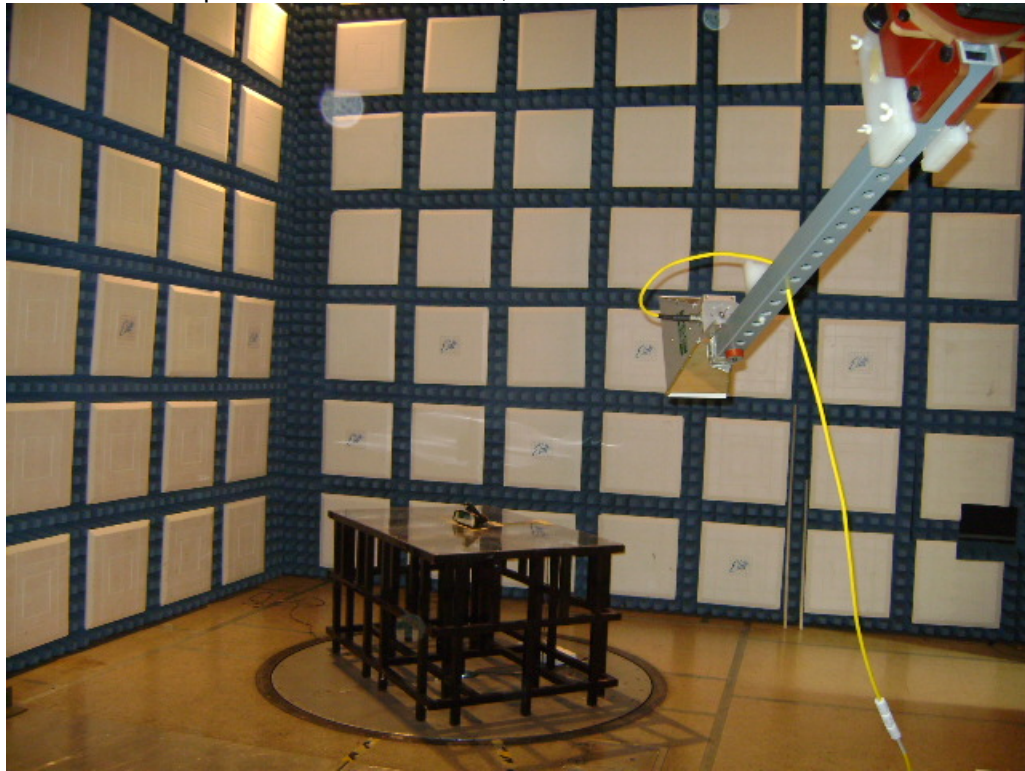
Test Set-up for Radiated Emissions, 1GHz to 5GHz – Horizontal Polarization