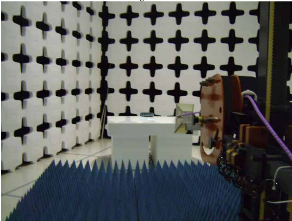
Test Setup for Radiated Emissions, 30MHz to 1GHz – Horizontal Polarization