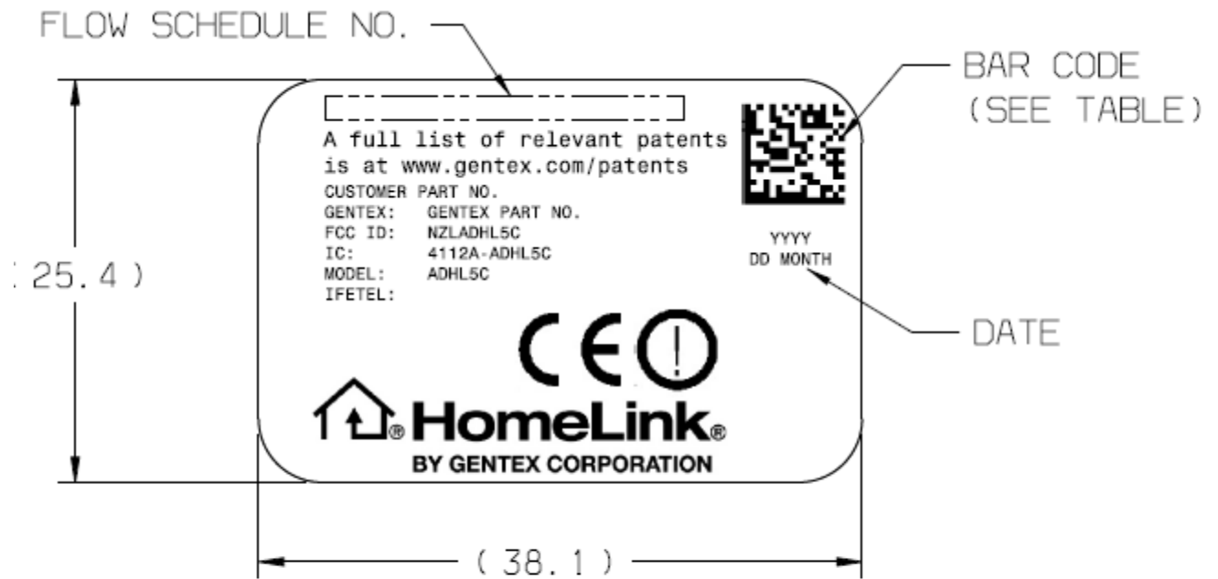
PATENT LABEL 'M' - ITEM 2 SCALE: 2:1