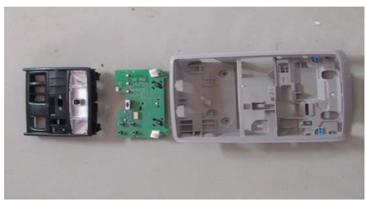
Rear View with HL apart from Assembly Unite