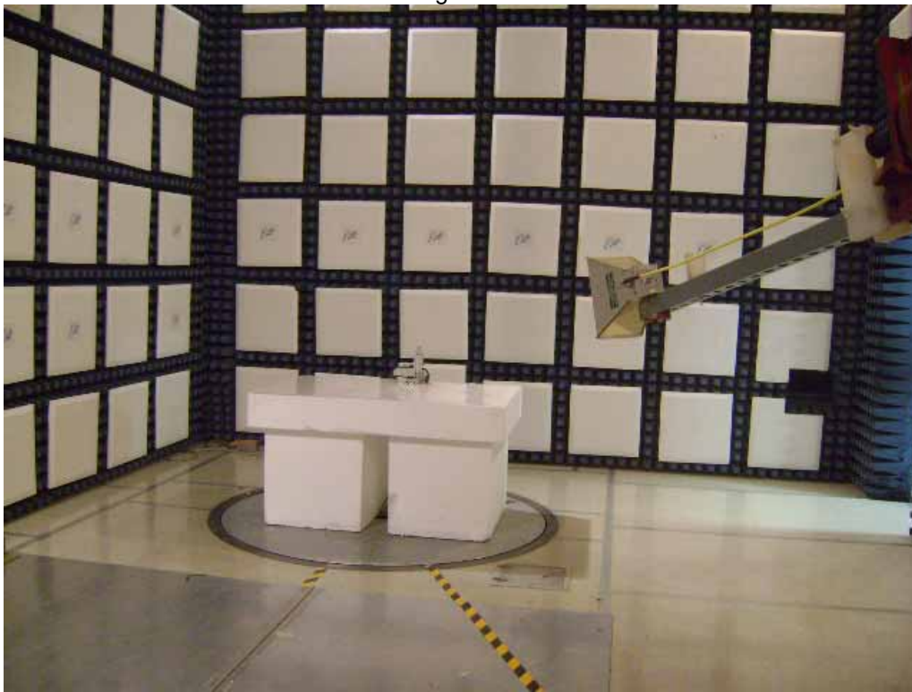
Test Setup for Radiated Emissions above 1000MHz Horizontal Polarity