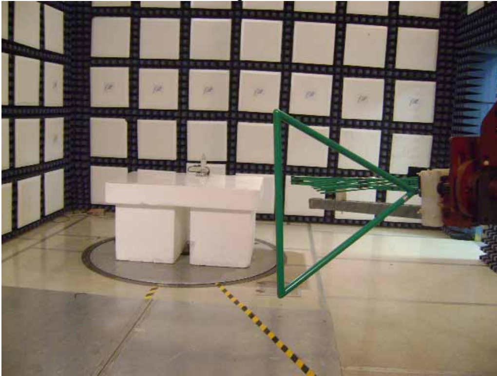
Test Setup for Radiated Emissions below 1000MHz Horizontal Polarity