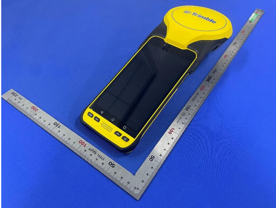
Front of the sample