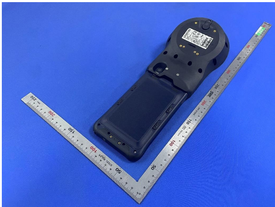
Rear of the sample