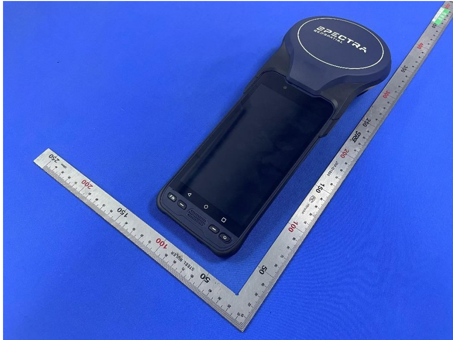
Front of the sample