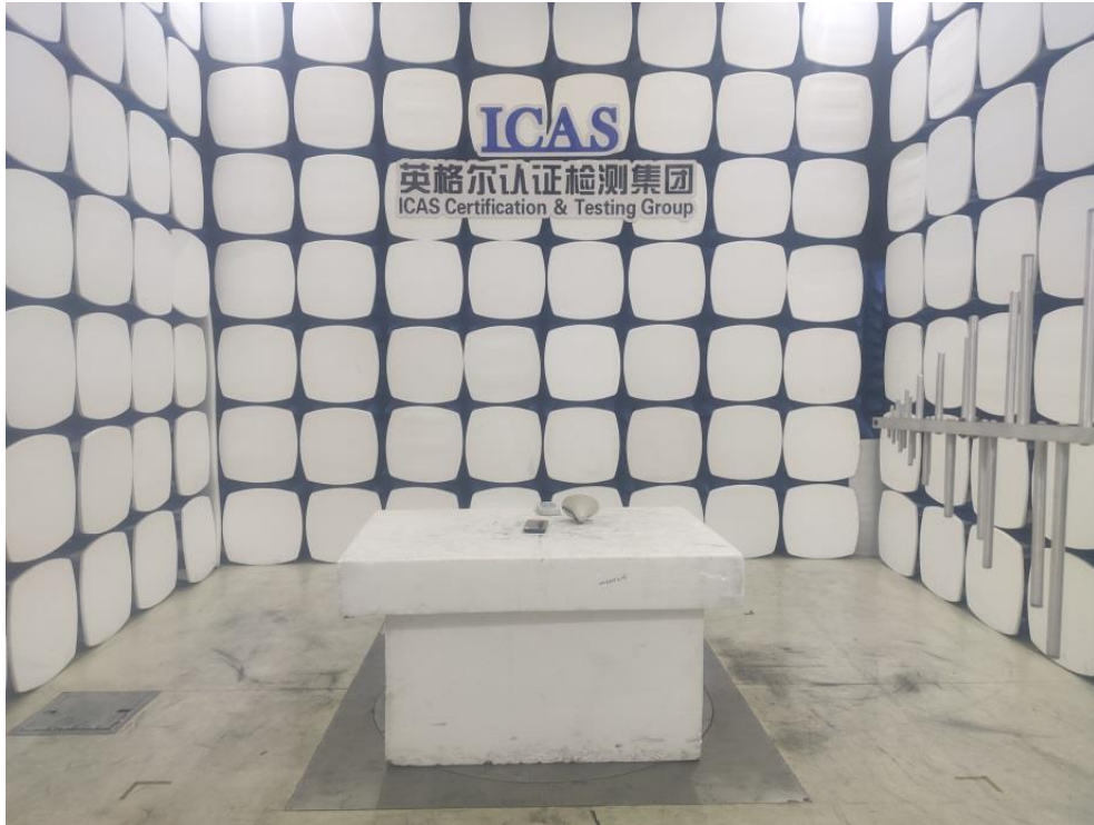
Below 1 GHz