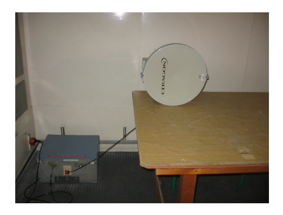
Photograph No.6 Setup for conducted emission measurements at the AC power lines