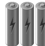
3x AA Batteries