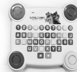
My Learn Mini

The following accessories come together in the box when you purchase: