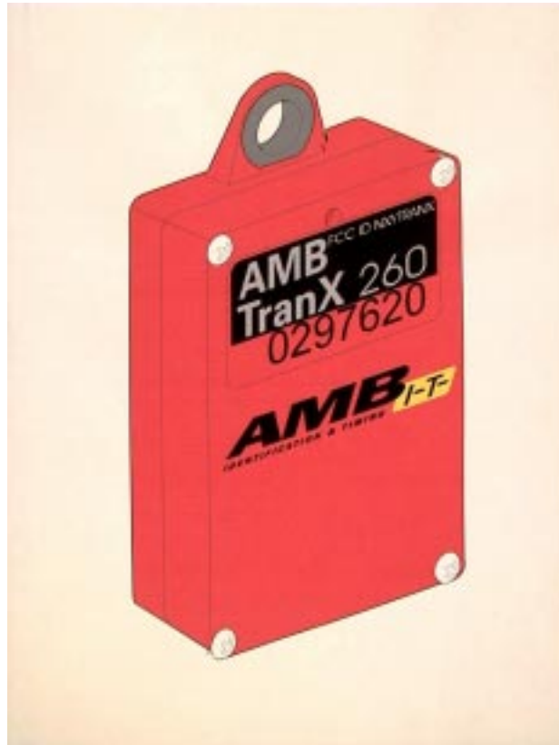
Label placement on TranX 260