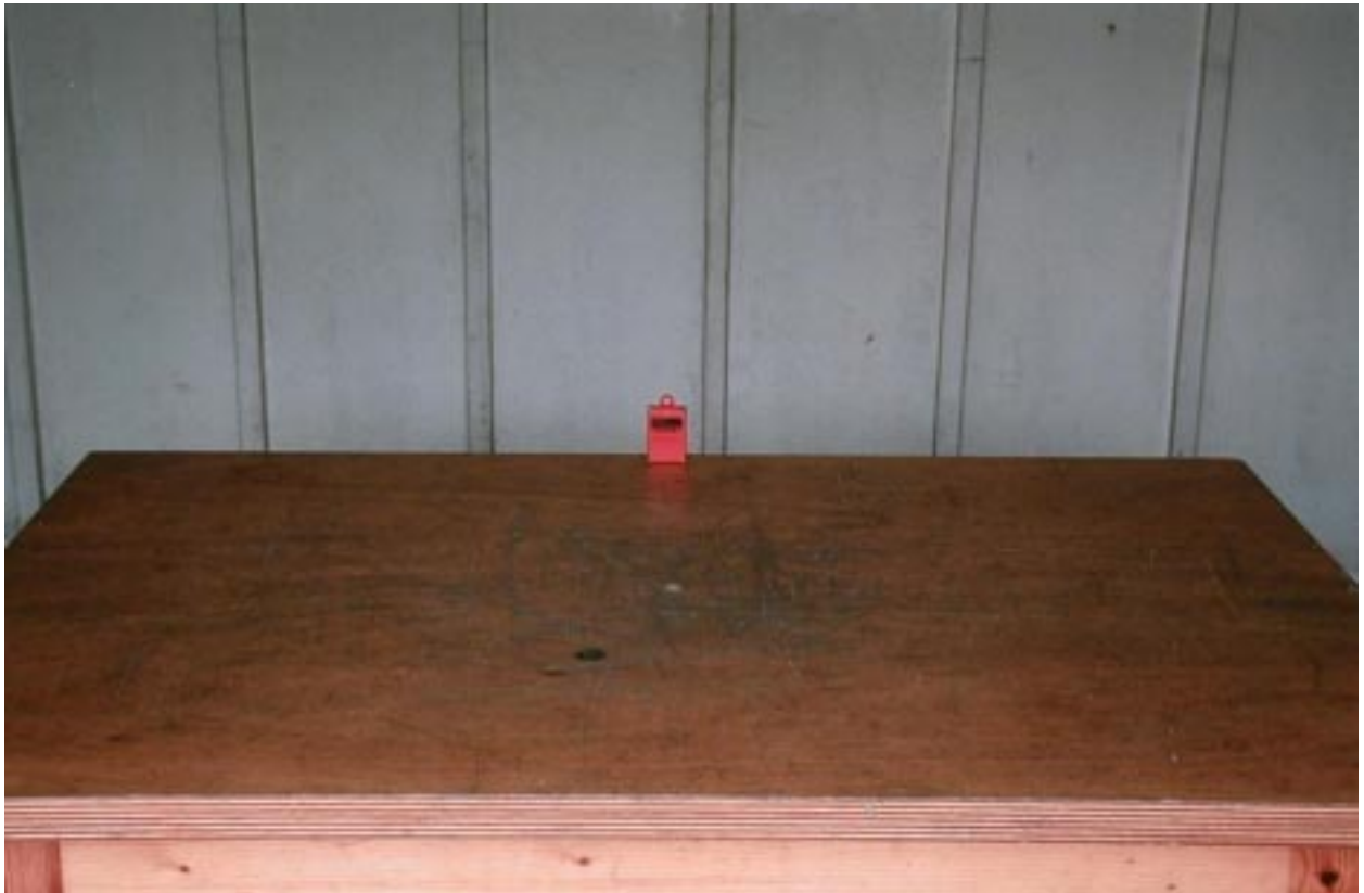
Test setup for TranX 260 (front, radiated emission measurements)