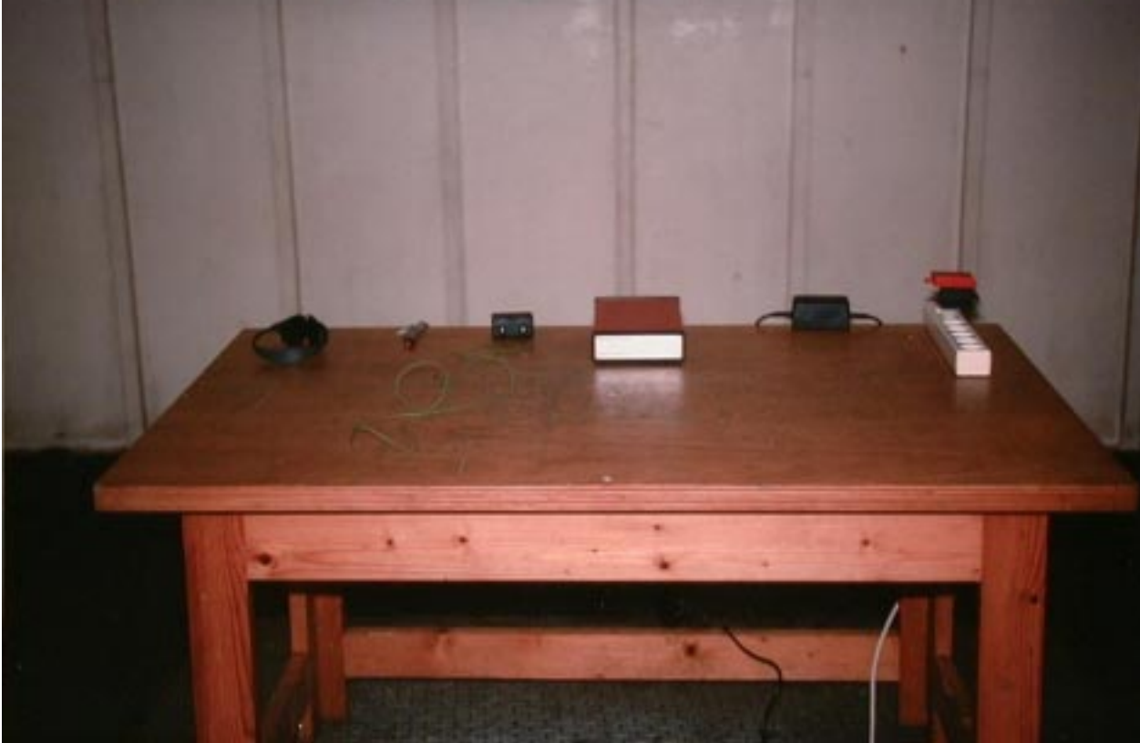
Test setup for TranX 260 and TranX decoder (front, radiated emission measurements)