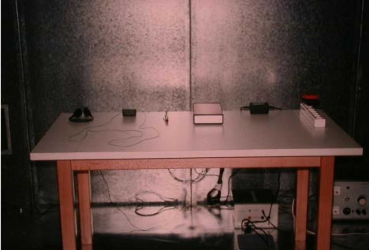
Test setup for TranX 260 and TranX decoder (front, conducted emission measurements)