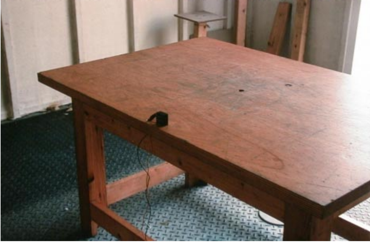
Test setup for TranX 120 (back, radiated emission measurements)