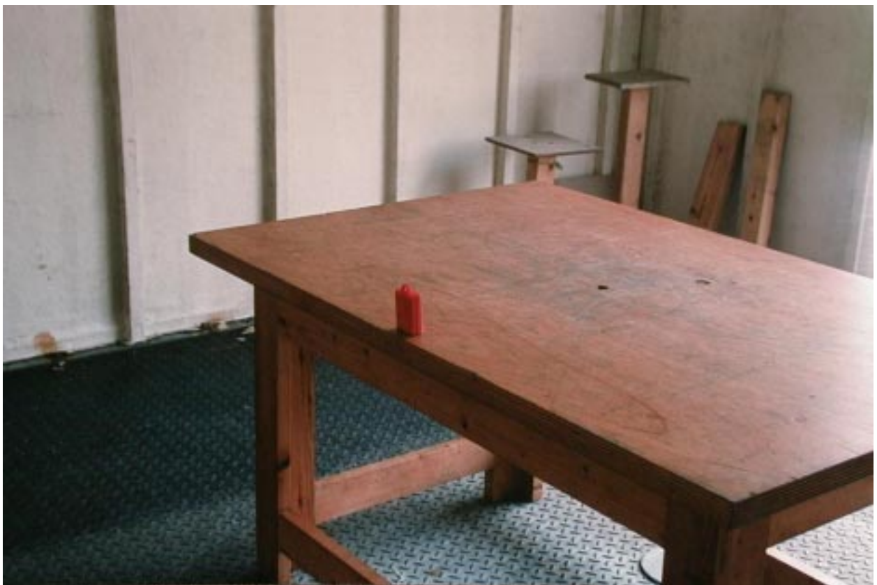
Test setup for TranX 260 (back, radiated emission measurements)