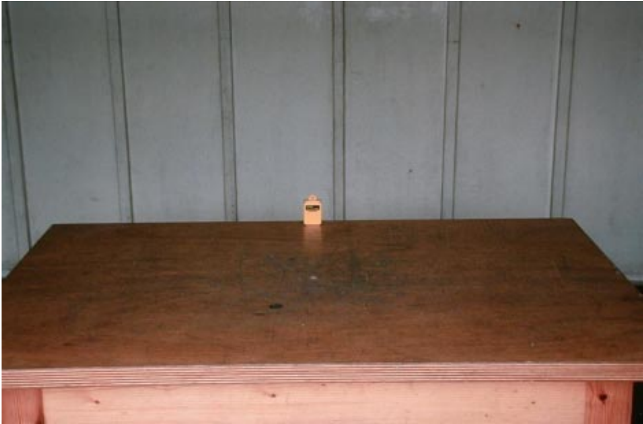
Test setup for TranX 160 (front, radiated emission measurements)