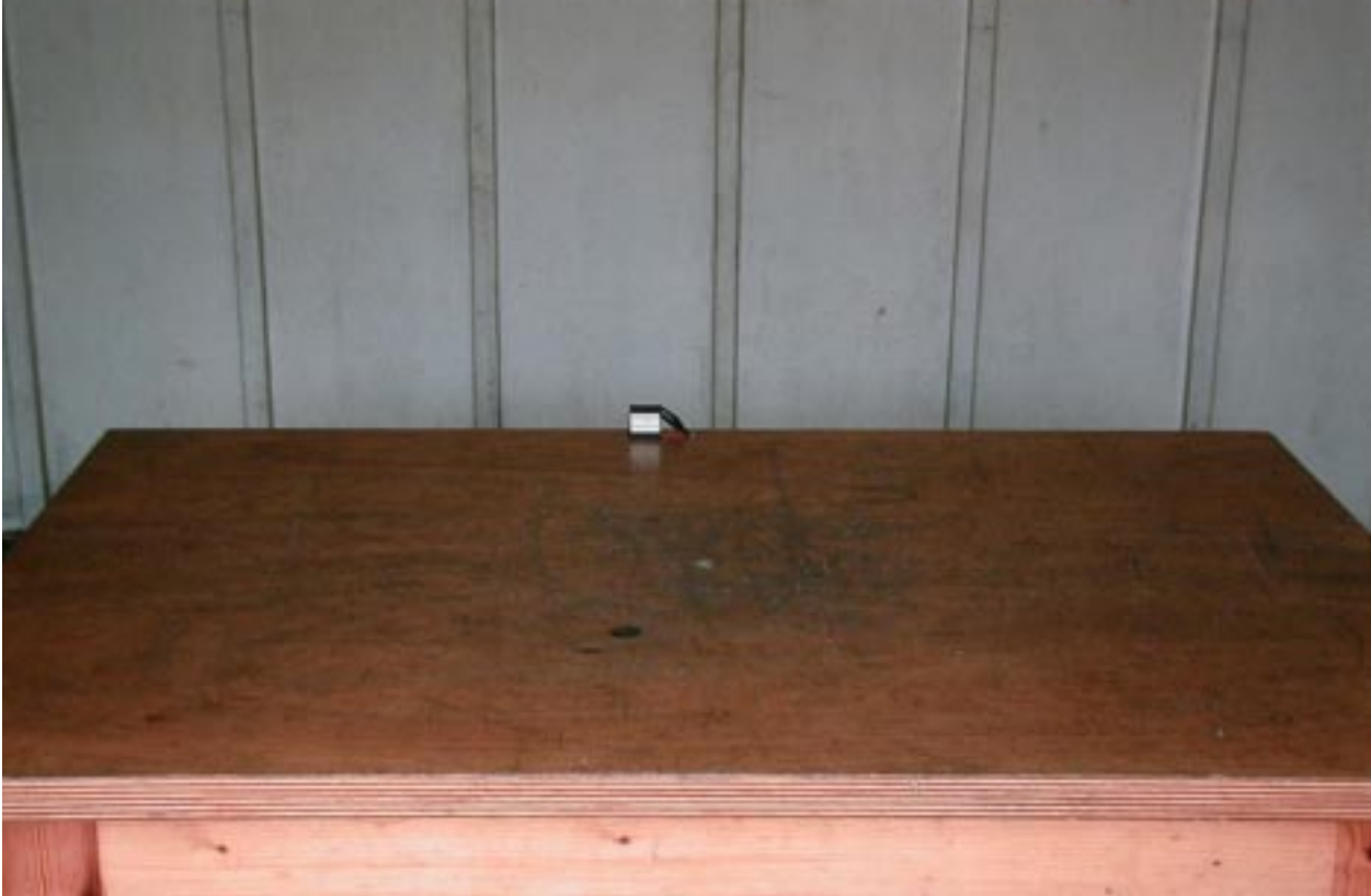
Test setup for TranX 120 (front, radiated emission measurements)