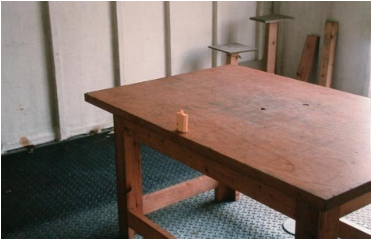
Test setup for TranX 160 (back, radiated emission measurements)