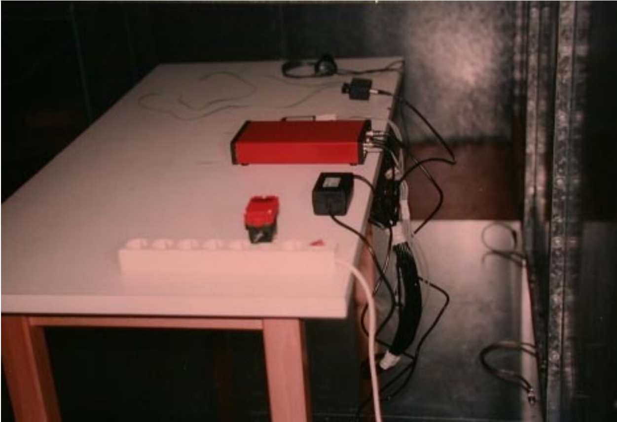
Test setup for TranX 260 and TranX decoder (back, conducted emission measurements)