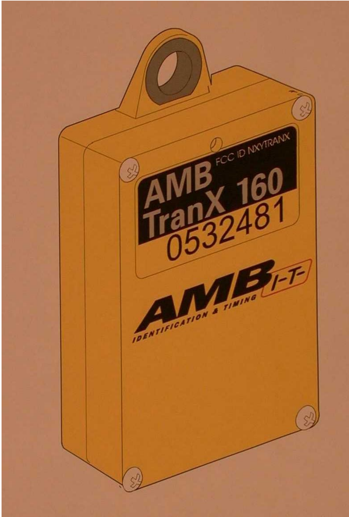
Label placement on TranX 160