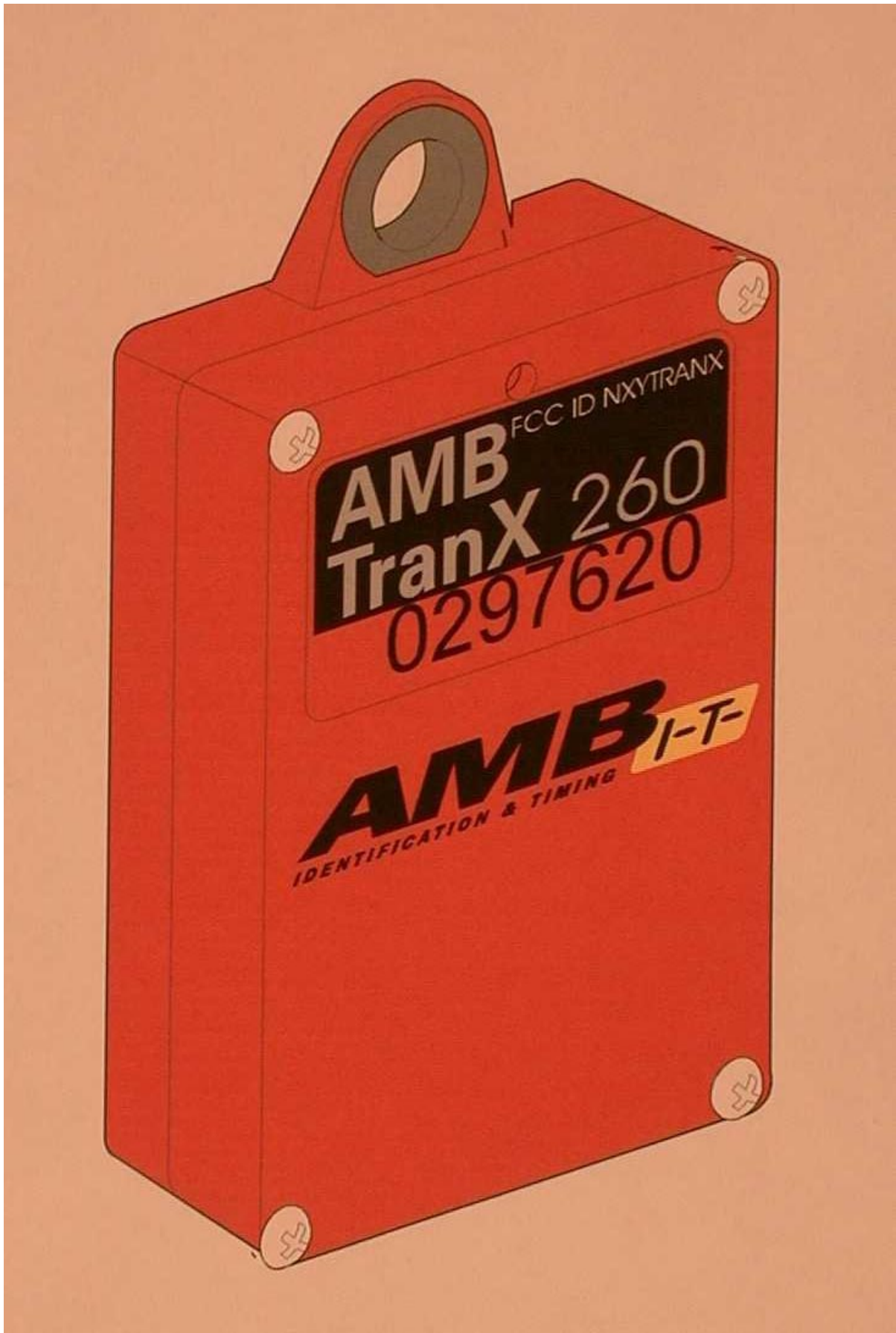
Label placement on TranX 260