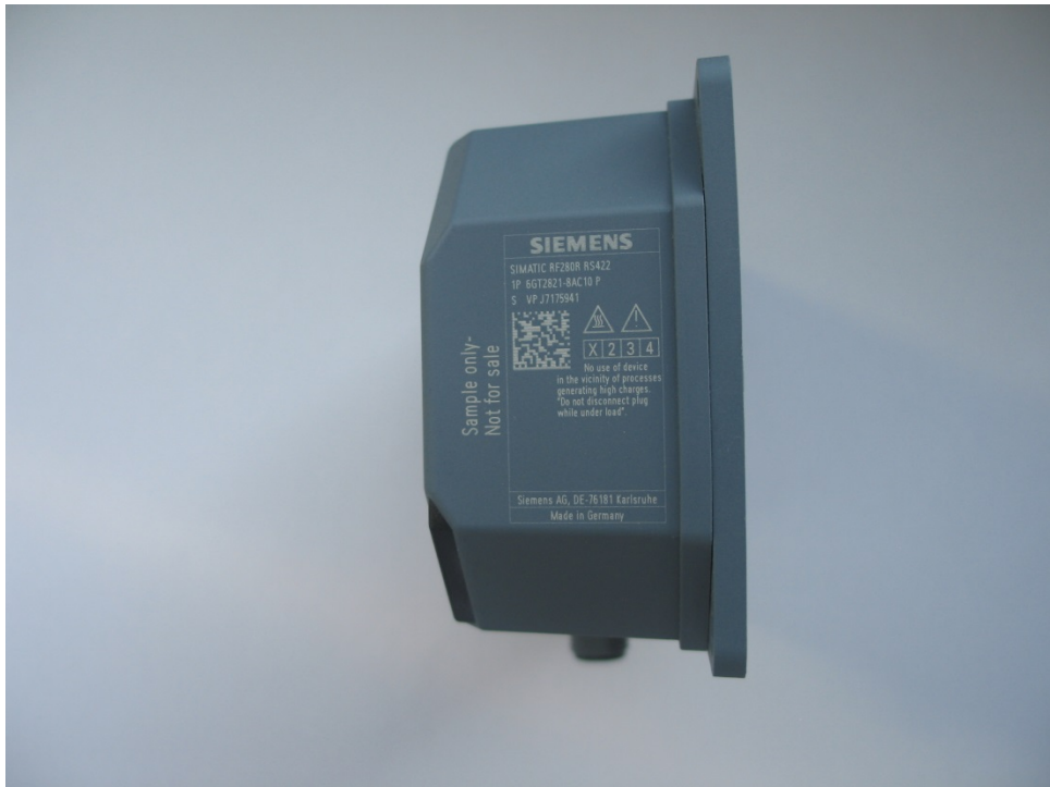
Fig. 8: right