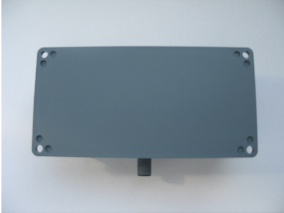
Fig. 7: rear