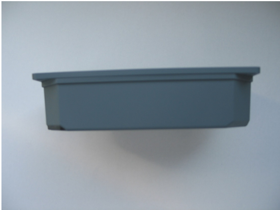
Fig. 10: top