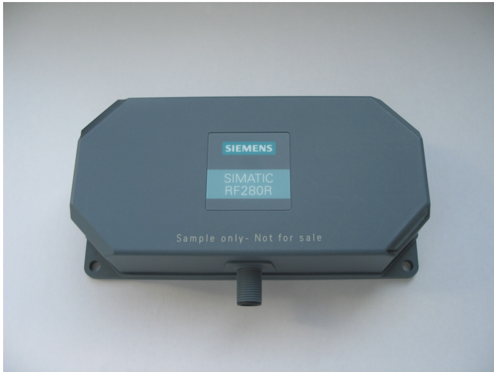
Fig. 6: Front