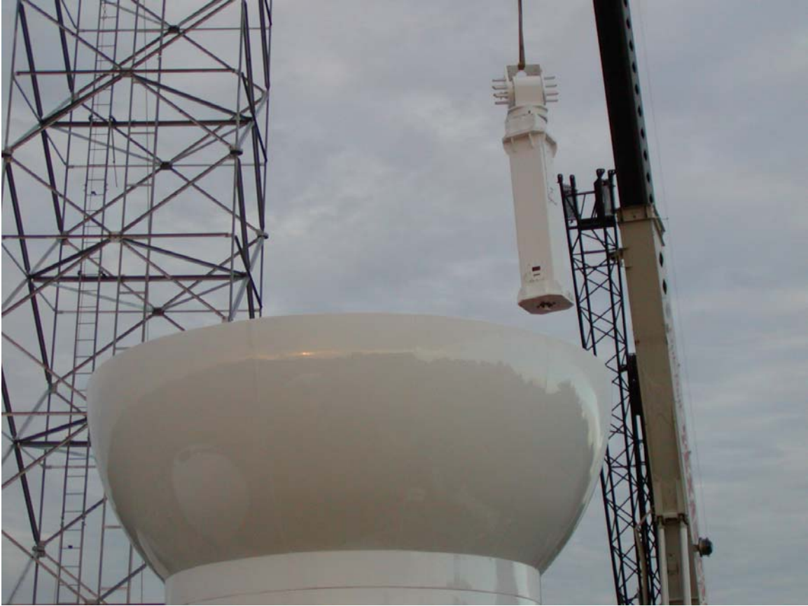
Pedestal is lifted to be installed on the top plate of tower