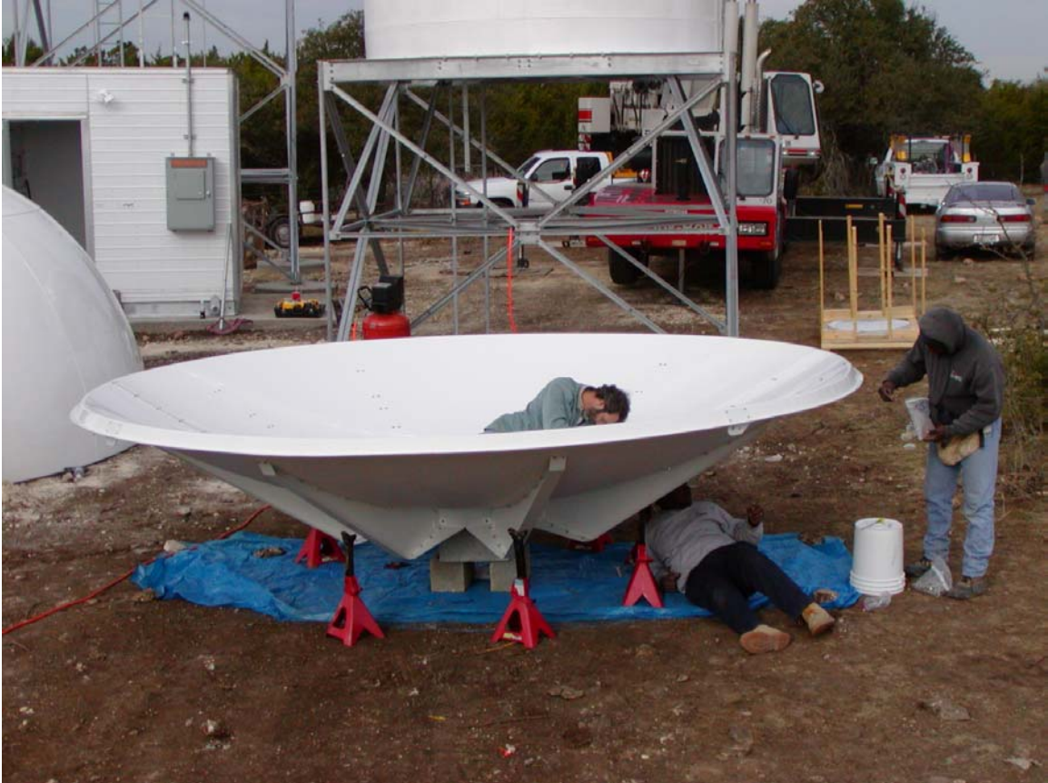
Antenna is assembled