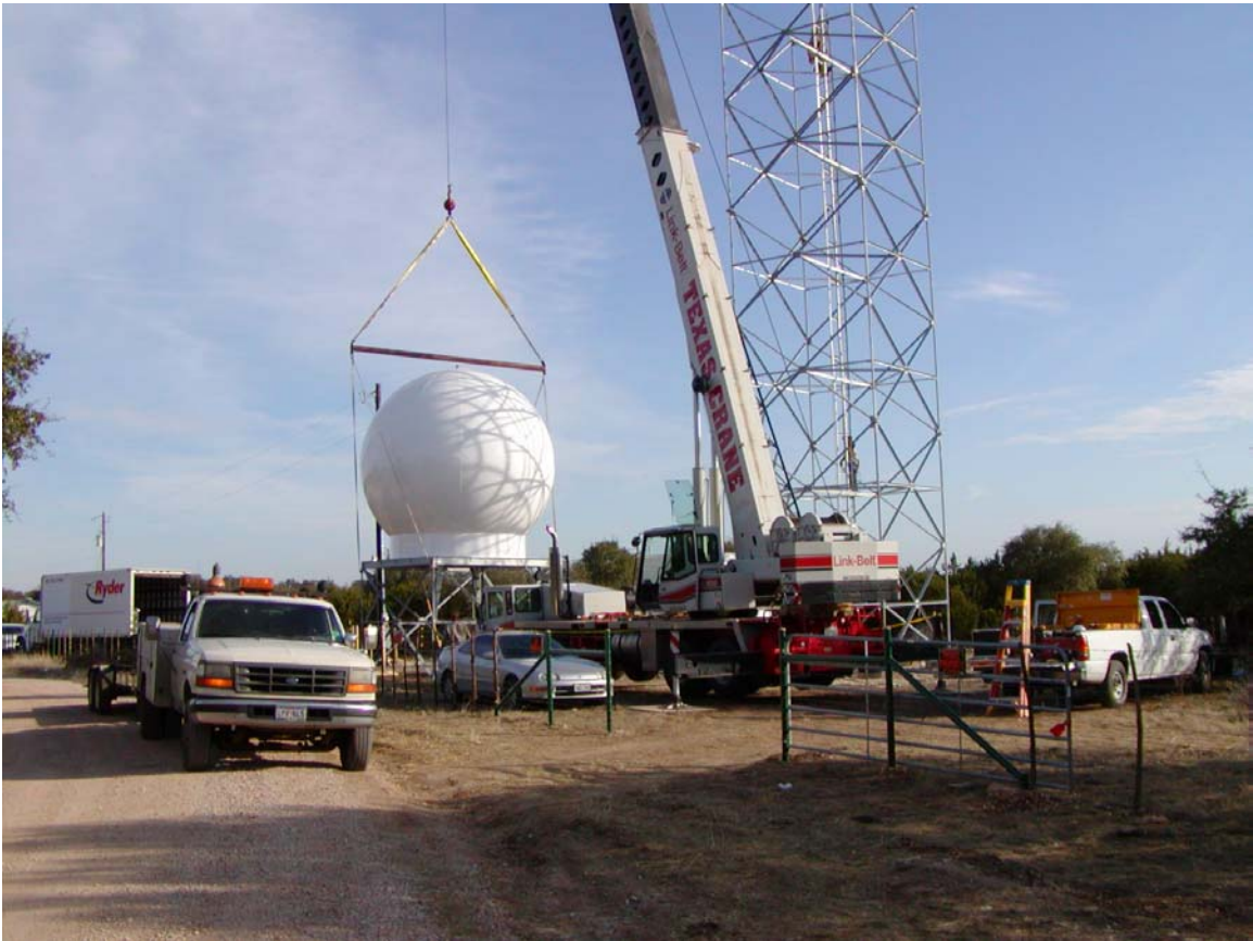
Top plate assembly is strapped and ready for placement on the tower.