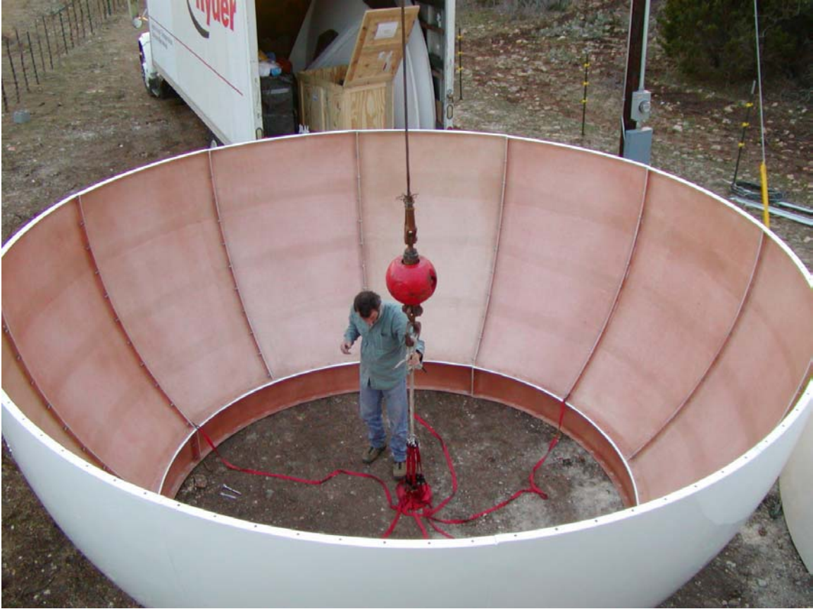
Bottom of radome is constructed and prepared for lifting