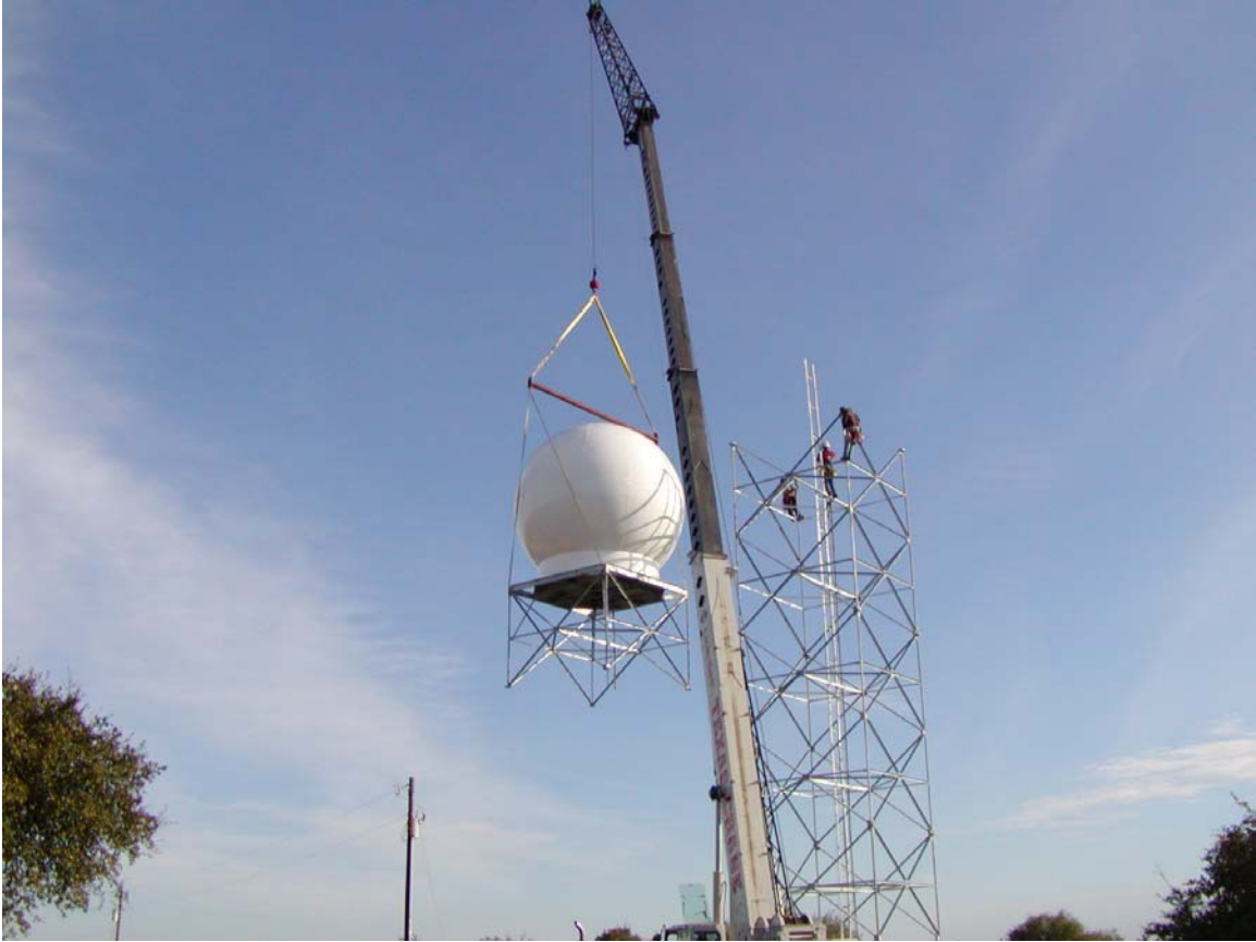
Top plate assembly is being lifted into place for installation.