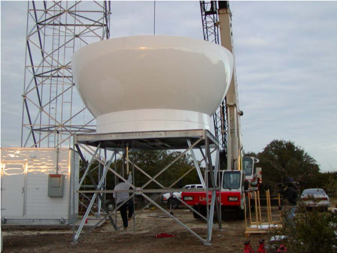
Bottom half is lifted into place on the top plate of the tower