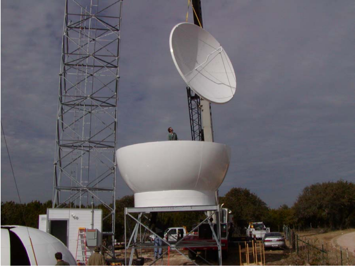
Antenna is lowered to be mounted on to the pedestal