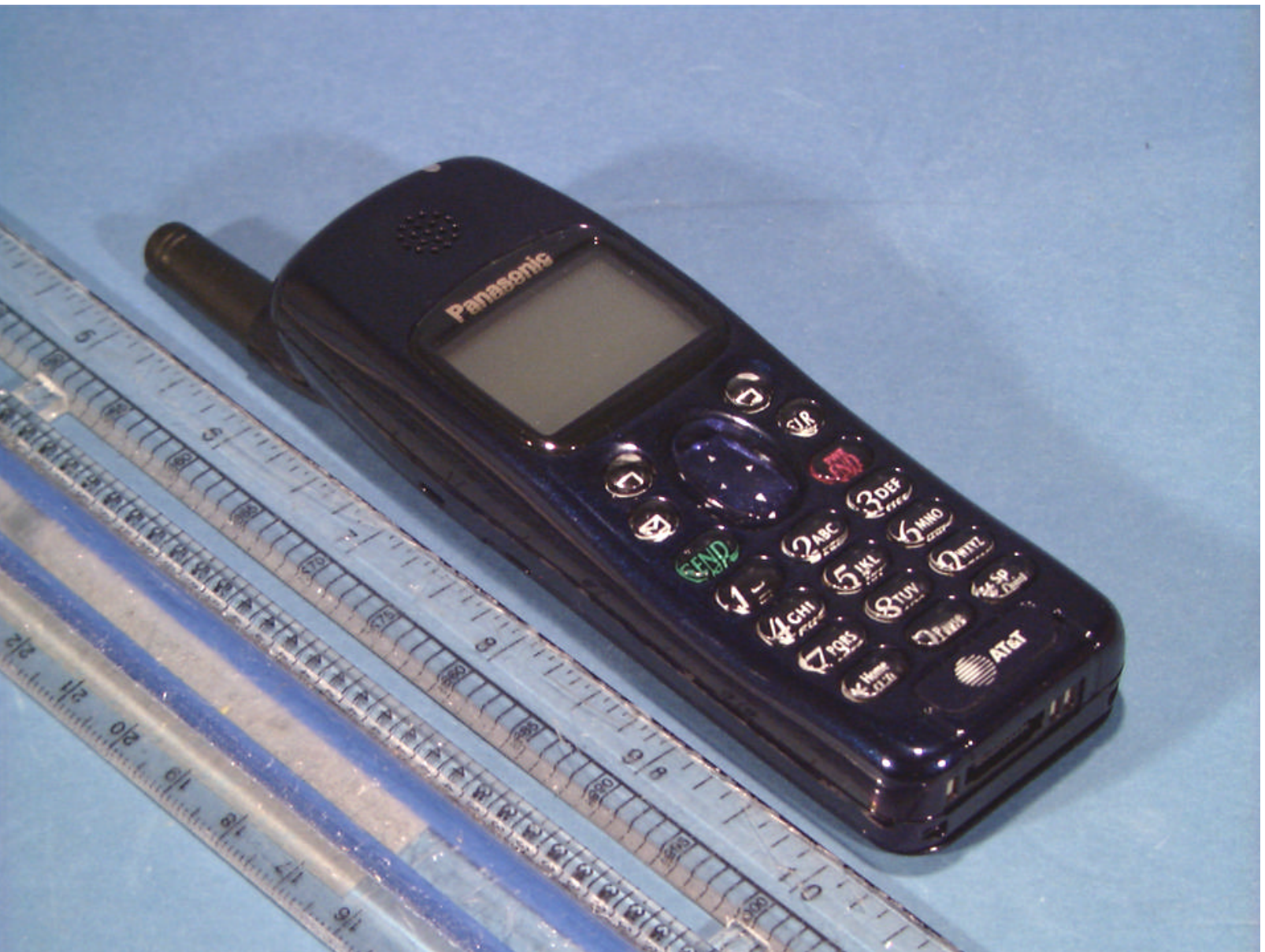
© 2000 PCTEST Lab Panasonic FCC ID: NWJ10A002A (Models: EB1X-210 / 220) NVLAP Lab Code: 1004310 Tri-Mode Dual-Band Phone (AMPS/TDMA)