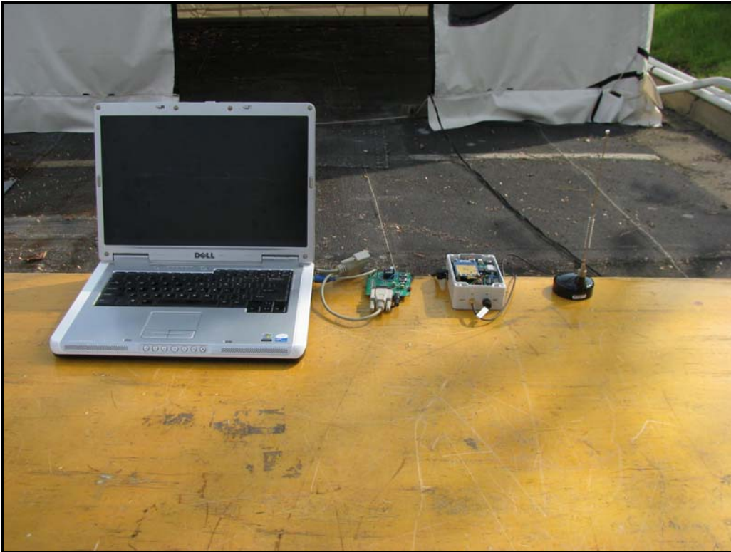
Photograph 2: Radiated Testing – Front View