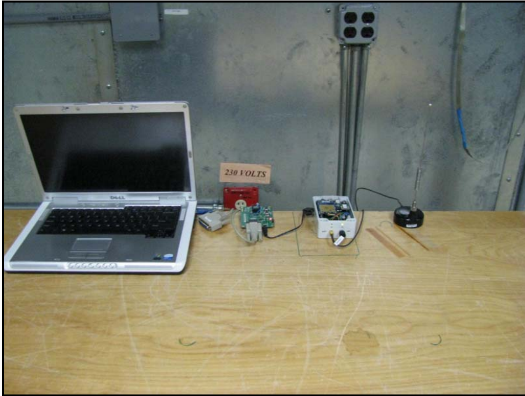
Photograph 4: Conducted Testing – Front View