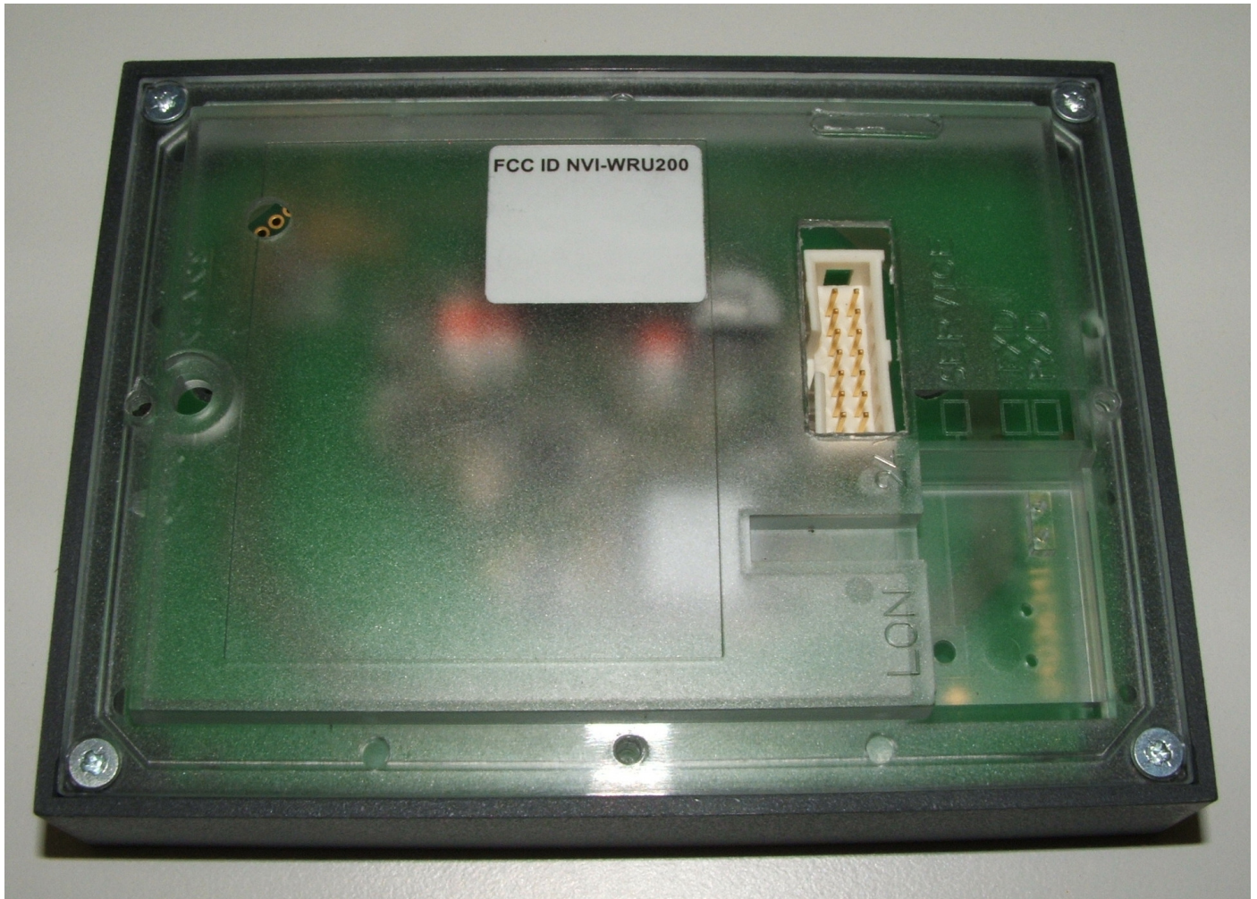
LEGIC advant module