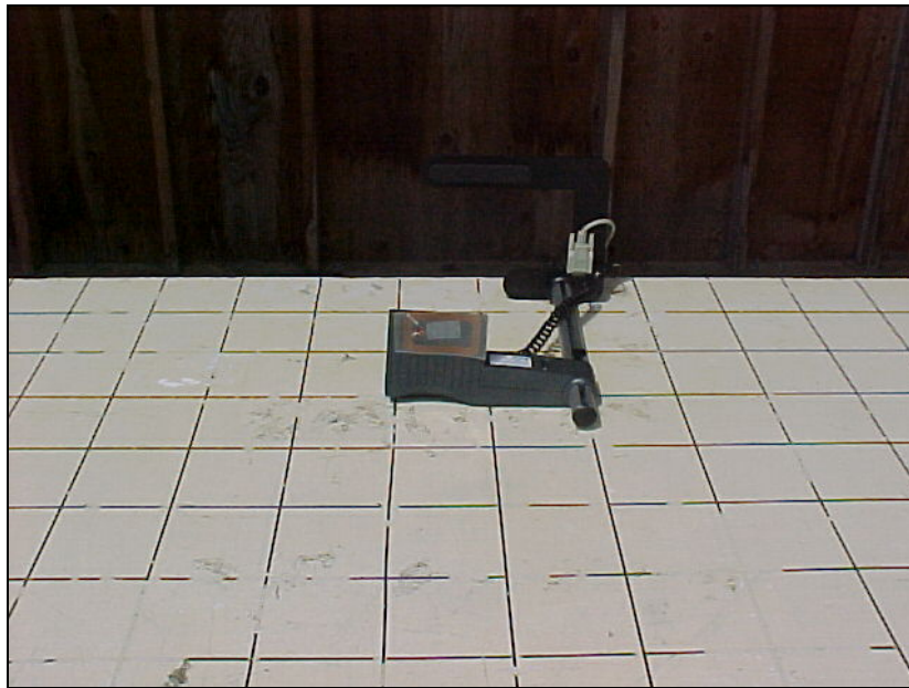
Views of the EUT during Radiated Emissions testing.