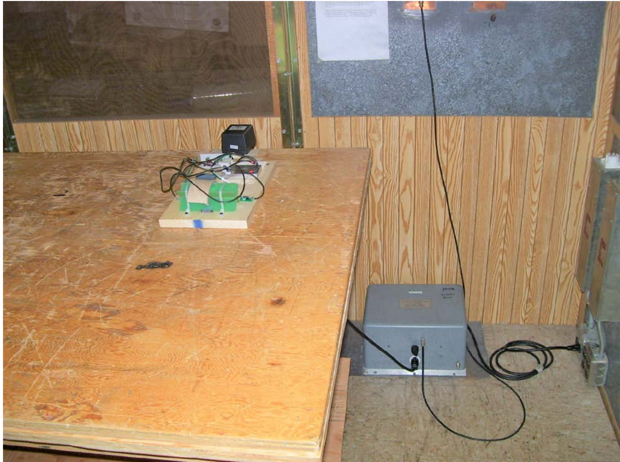
Photo Description: AC Line Conducted – Front with antennas connected

Company: Brady Corporation Model: BDCi5100 RFID ASSEMBLY Name: BDCi5100 RFID ASSEMBLY Date: 11-20-2017