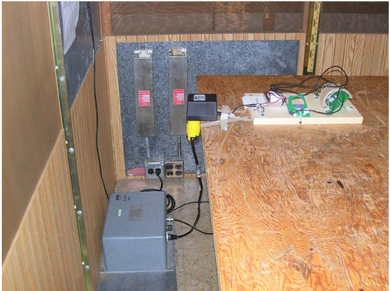
Photo Description: AC Line Conducted – Back with antennas connected

Company: Brady Corporation Model: BDCi5100 RFID ASSEMBLY Name: BDCi5100 RFID ASSEMBLY Date: 11-20-2017