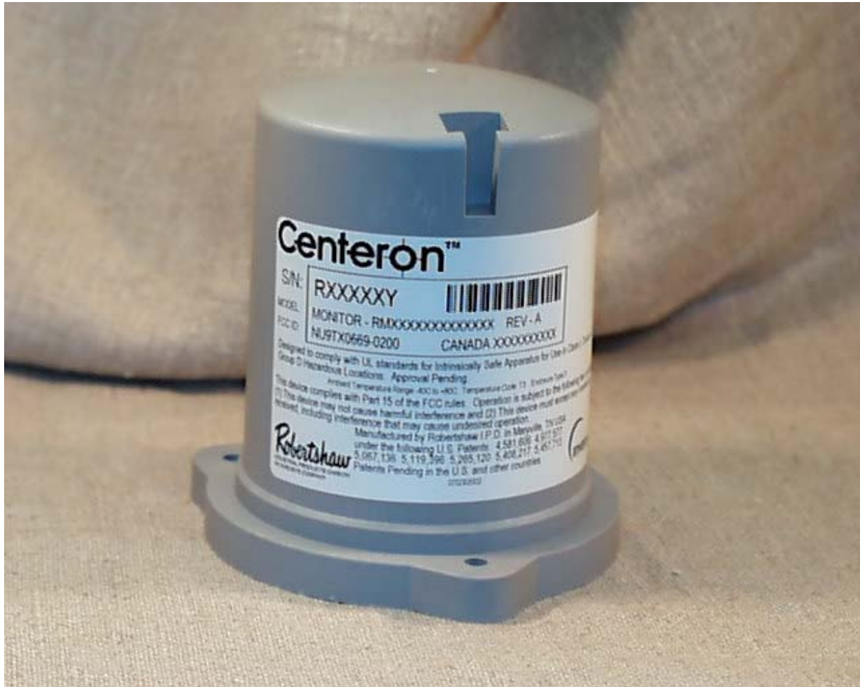
Figure 1: Photograph of outside chassis – cover