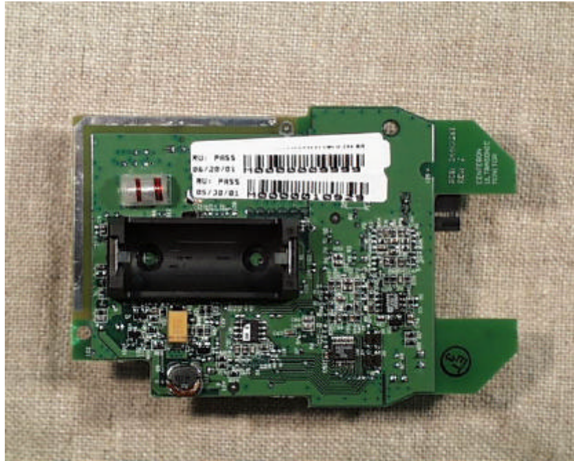
Exhibit 9A: Printed circuit board, top view