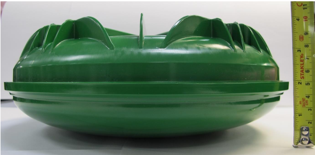
Figure 4: Right