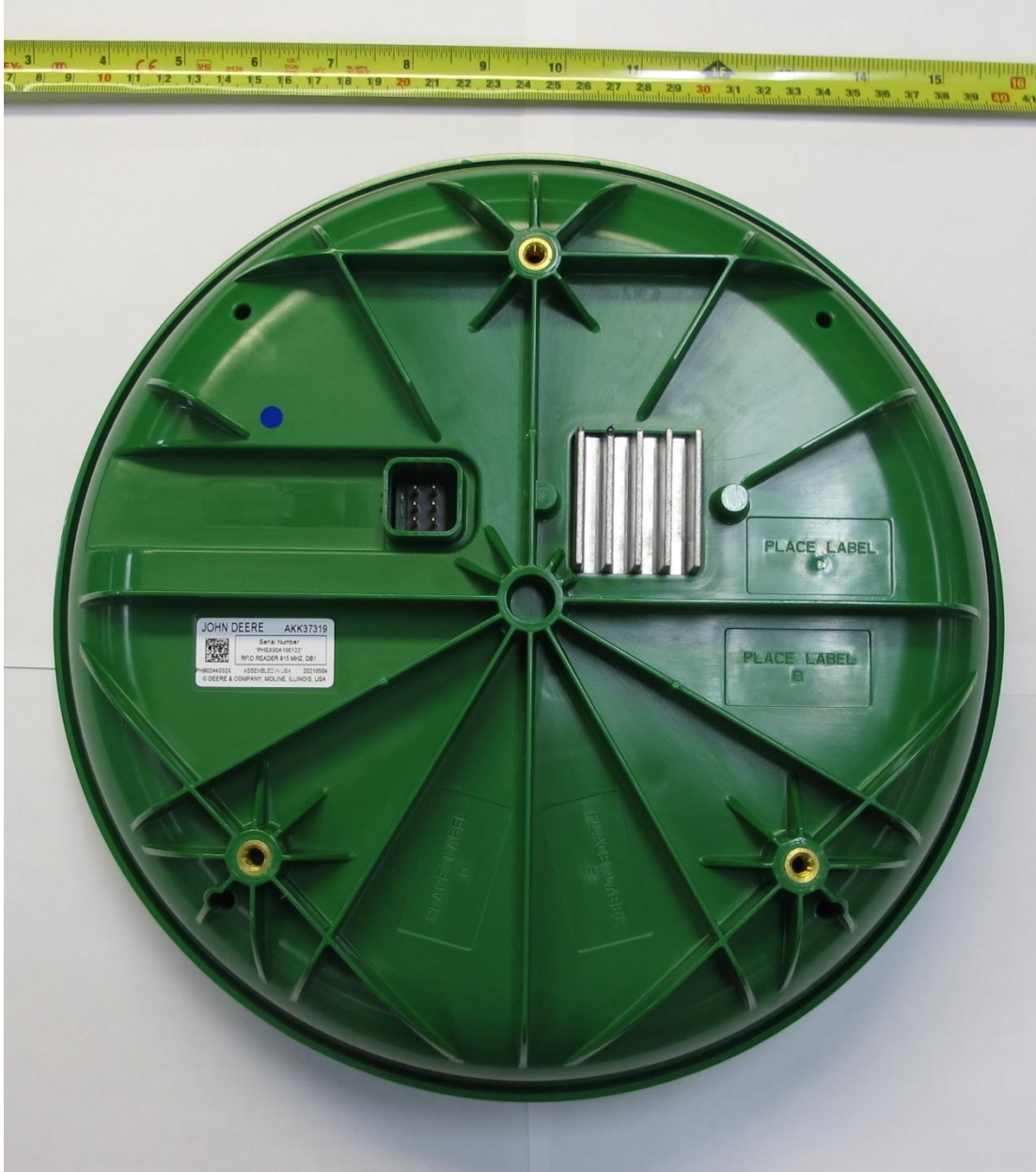
Figure 5: Bottom