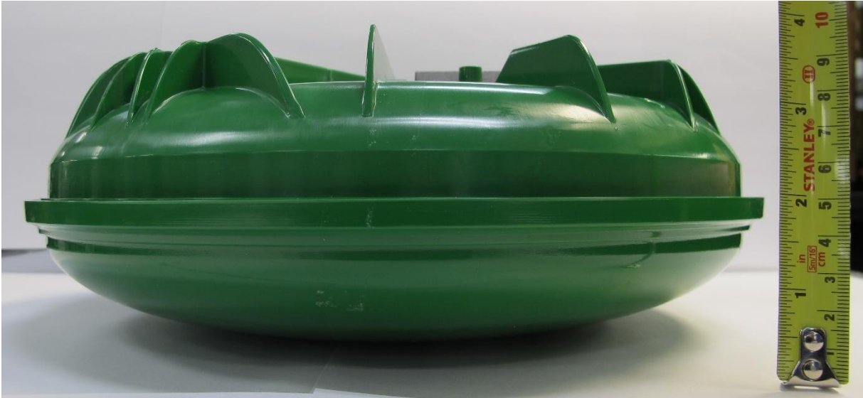
Figure 1: Back