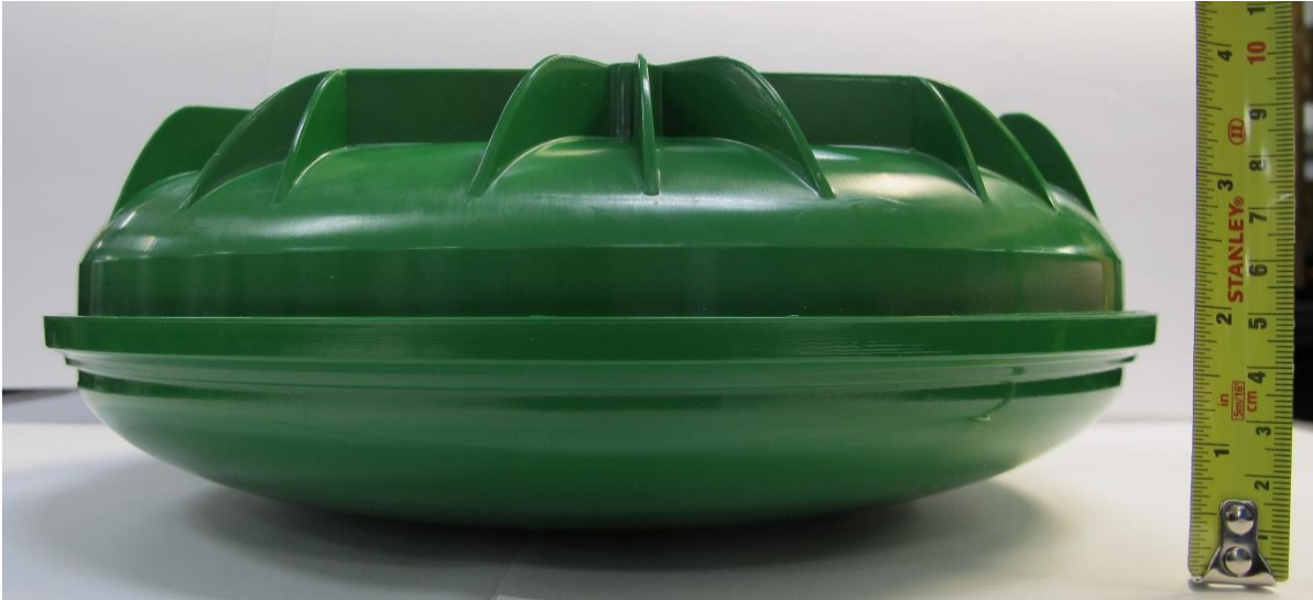
Figure 2: Front