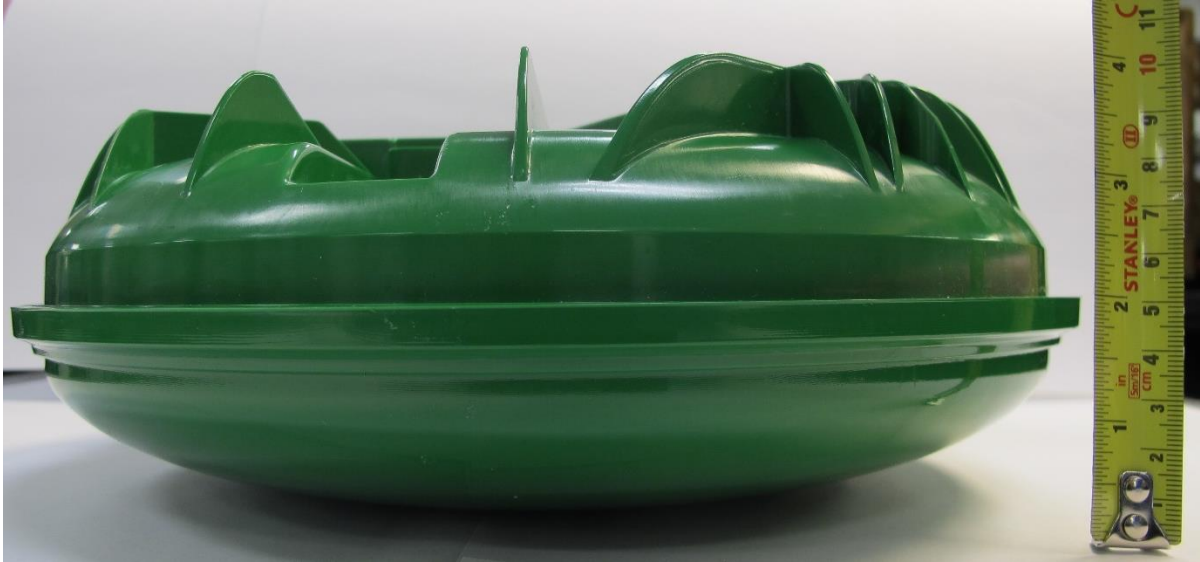
Figure 3: Left