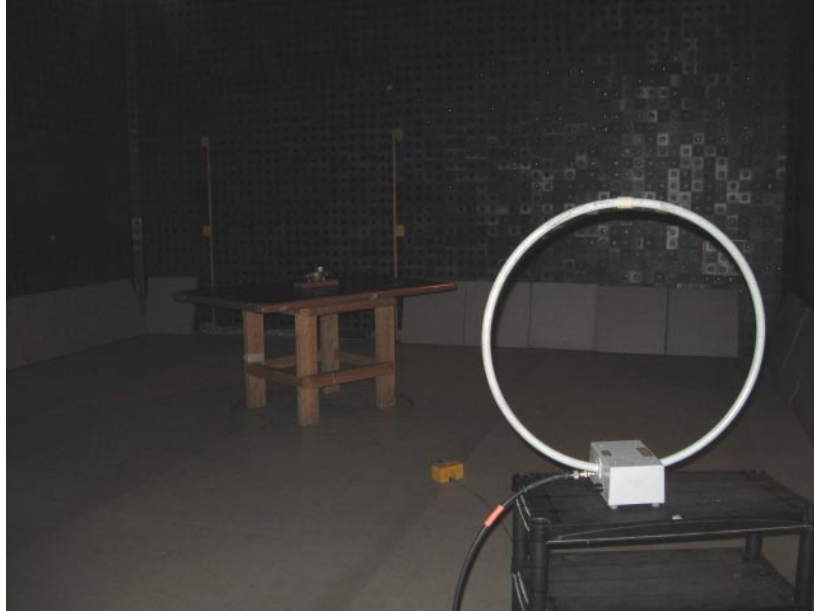
Photograph No.1 Setup for spurious emission measurements in the anechoic chamber below 30 MHz